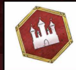
RIGHTEOUS MEDAL OF VIGOR