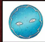
RIGHTEOUS MEDAL OF CLARITY