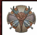
RIGHTEOUS MEDAL OF COMMAND