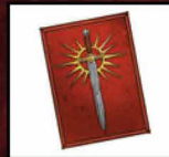
RIGHTEOUS MEDAL OF SPIRIT