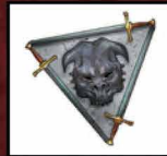
RIGHTEOUS MEDAL OF AGILITY