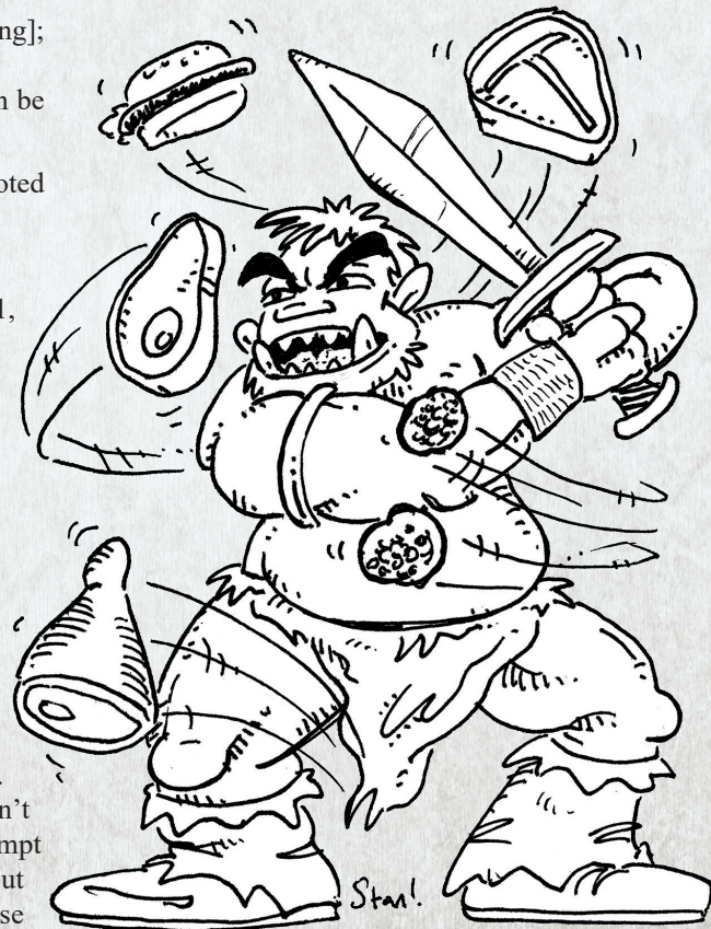
Misinterpretation of Meatier Swarm

This spell functions like summon swarm , but the swarm you summon has twice as many hit points as normal and the DCs of all of its abilities (distraction, poison, etc.) are increased by 2.