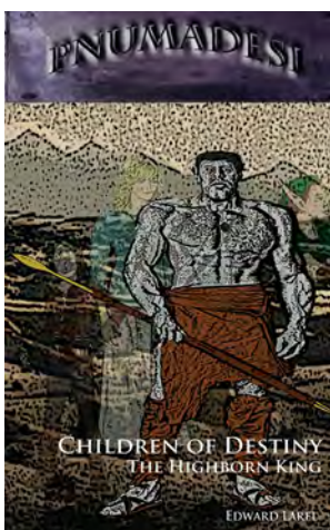
The Highborn King