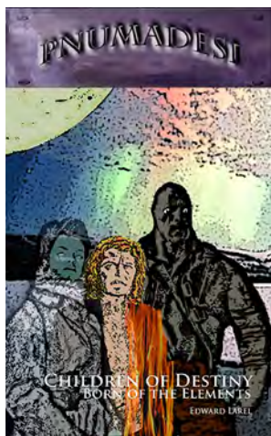
Born of the Elements