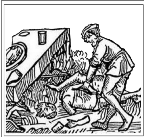
Dreadful discovery of another victim to Three Coin Killer in Reaver Street.