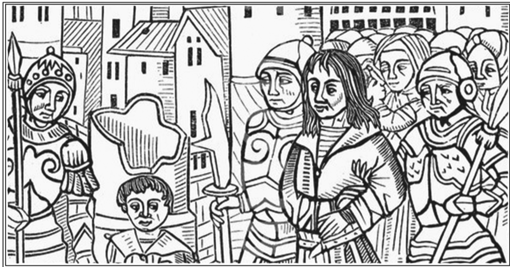
The arrest and capture of General Kedrach, late of the Legion of the Raven.

(Darringmoor, 33rd of Earth, 2150) A group of Sardinian spies have been arrested on the evening of the 33rd, having been found to be hiding in a disused part on the Undercity. The group of six men were taken by surprise by detachment of the City Guard, led by Paladins of Order the Silver Swan, following a tip-off by reliable sources. The Sardians gave some initial resistance and one of their number was killed before they surrendered. No casualties were reported amongst the Guards and the Paladins.