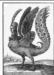
The bird is dressed

Available from Neesta's Clothing and Embroidery Shop.