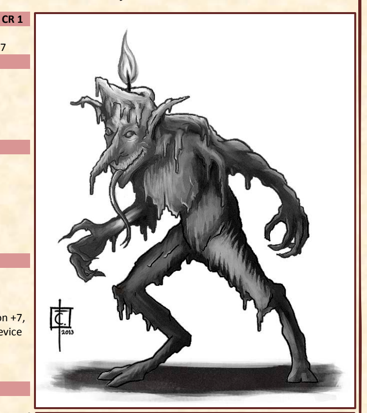
A wickling infestation is equal parts horror and comedy of errors.; a blend of patience and pyromania... precision and blundering chaos. - Jalar Tombren; fey scholar

WICKLING FAMILIARS: Despite their book-burning tendencies, in some parts of the world it is not uncommon to see wizards with less scruple than sense poring over their spellbooks by the candlelight cast by their wickling familiars. In order to gain a wickling familiar, a spellcaster must be neutral evil, have a caster level of 5th, and have the Improved Familiar feat.