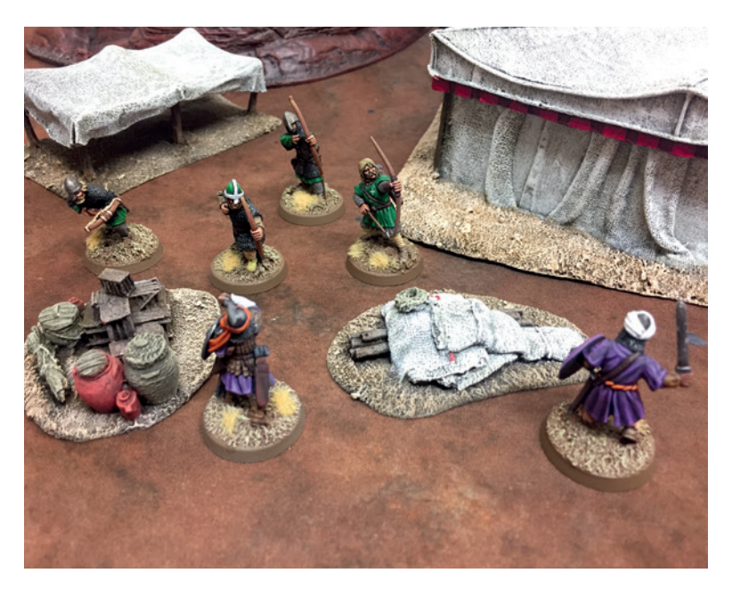
A small band of Crusader archers bravely defend their camp from Saracen raiders.