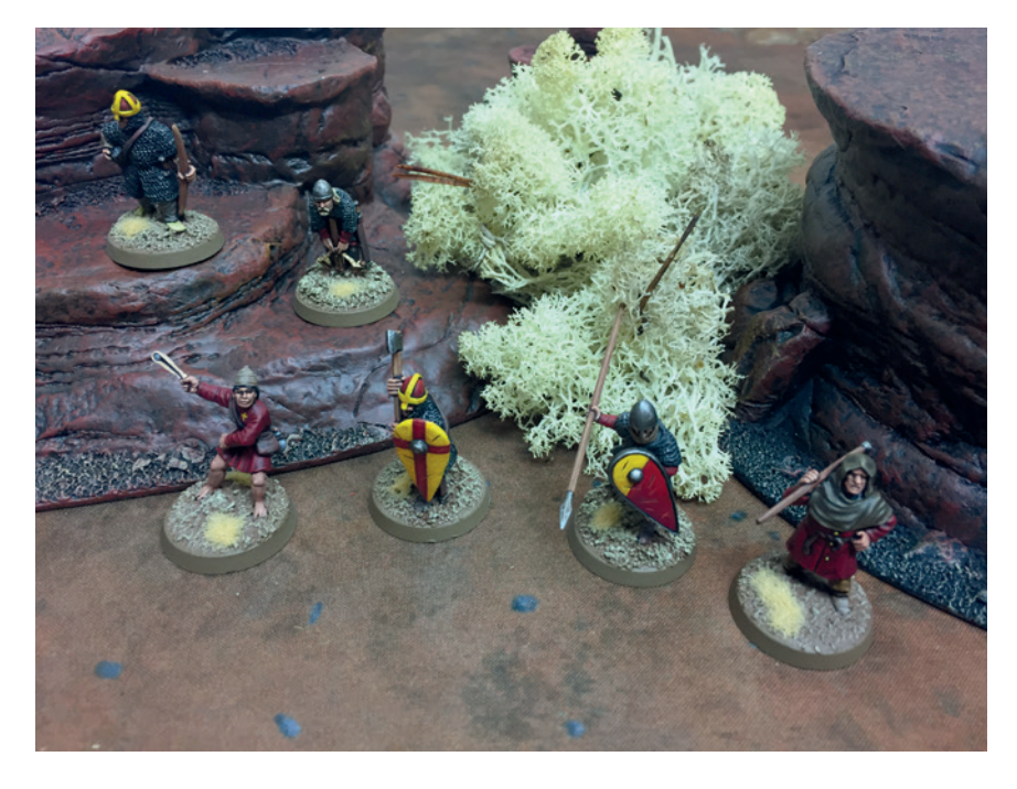
A band of newly arrived crusaders search the Holy Land for treasure and glory in the name of God.

Commoners made up the bulk of the Crusader armies, as such there are a lot of career options available to these individuals. However, as they are not of noble birth these individuals may not rise to command your warband (unless they are subsequently knighted...which is rare).