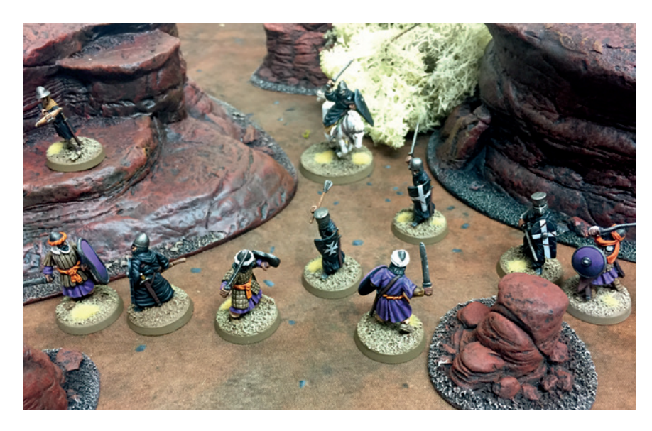
A scouting party of Saracen warriors is ambushed by the Order of the Hospital of St John.

Each of the values in the profile reflects a unique attribute of the fighter with a specific effect on how the model plays during the game. These are outlined as follows: Name: Each warrior needs a suitably fitting title to live up to.