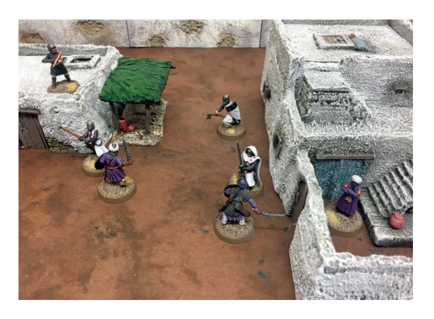
Military Order knights fight with Saracen warriors in the deserted streets of a Christian city.