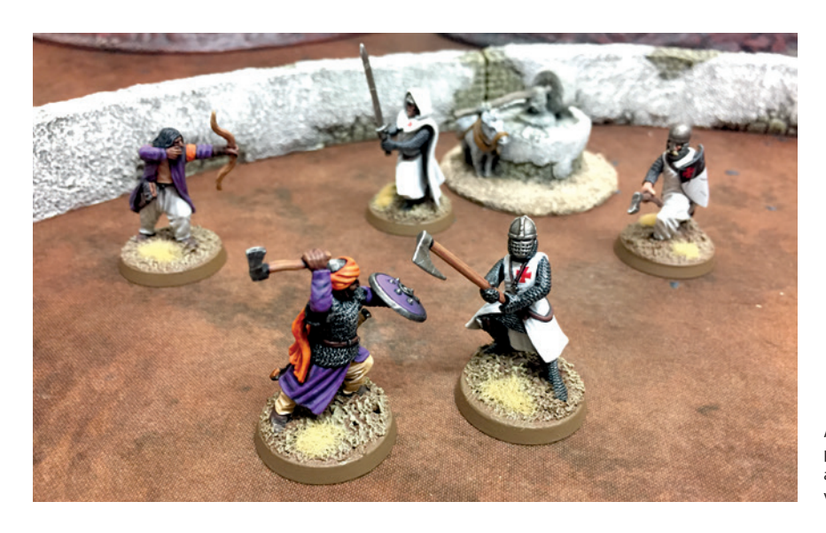
A small warband of Knights Templar push back a Saracen raiding party as they attempt to storm a Christian village.

If any available Saving roll is failed then the model will be Wounded by the shot. Usually, this will result in subtracting one from the model's Wound value. However, particularly powerful weapons can cause multiple Wounds and where this is the case it will be outlined in the weapons profile.