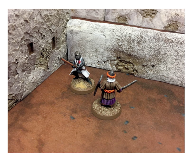
A Commander of the Temple and a Saracen warlord duel to the death.

To initiate a campaign you will need a minimum of two players and their starting warbands. However, the more players that take part the better the experience will be and so it is worth asking some other gamers to join in your conquest of the Holy Land. This will give you more players to fight, more tactical options to consider and increased chances to get your troops onto the table-top.