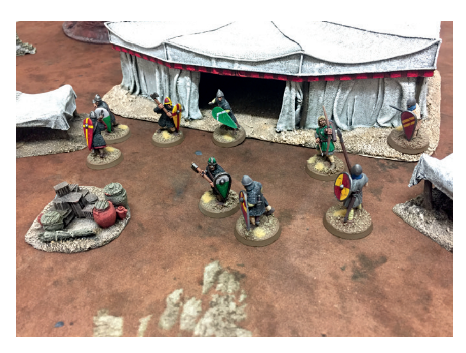
Military Orders and Crusaders battle amidst the streets of Outremer.

These options have great significance in a campaign (see page 43), however once a fighter has been slain or captured the model is now removed from the playing area.