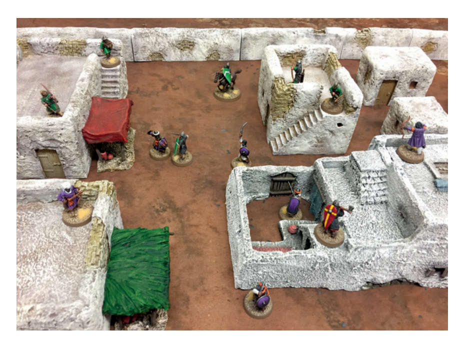
Two sizeable warbands fight for and honour glory in the streets of Acre.

Only fighters from the Saracen list can purchase the more advanced Compound Bows.