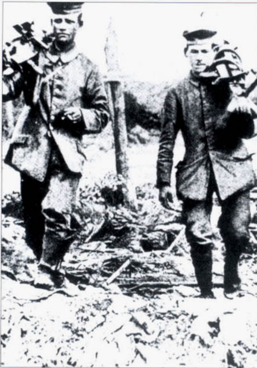
Two machine-gunners – a corporal (left) in a simplified M1907 field tunic, and a private in a M1915 tunic – carrying MG08/15 weapons. This 'light' modification was introduced in 1915 as a more mobile weapon for trench warfare, with a bipod, pistol grip and shoulder stock; however, it still weighed 43lb with a full water jacket and 100-round feed drum. The lack of equipment places this photograph behind the front lines.