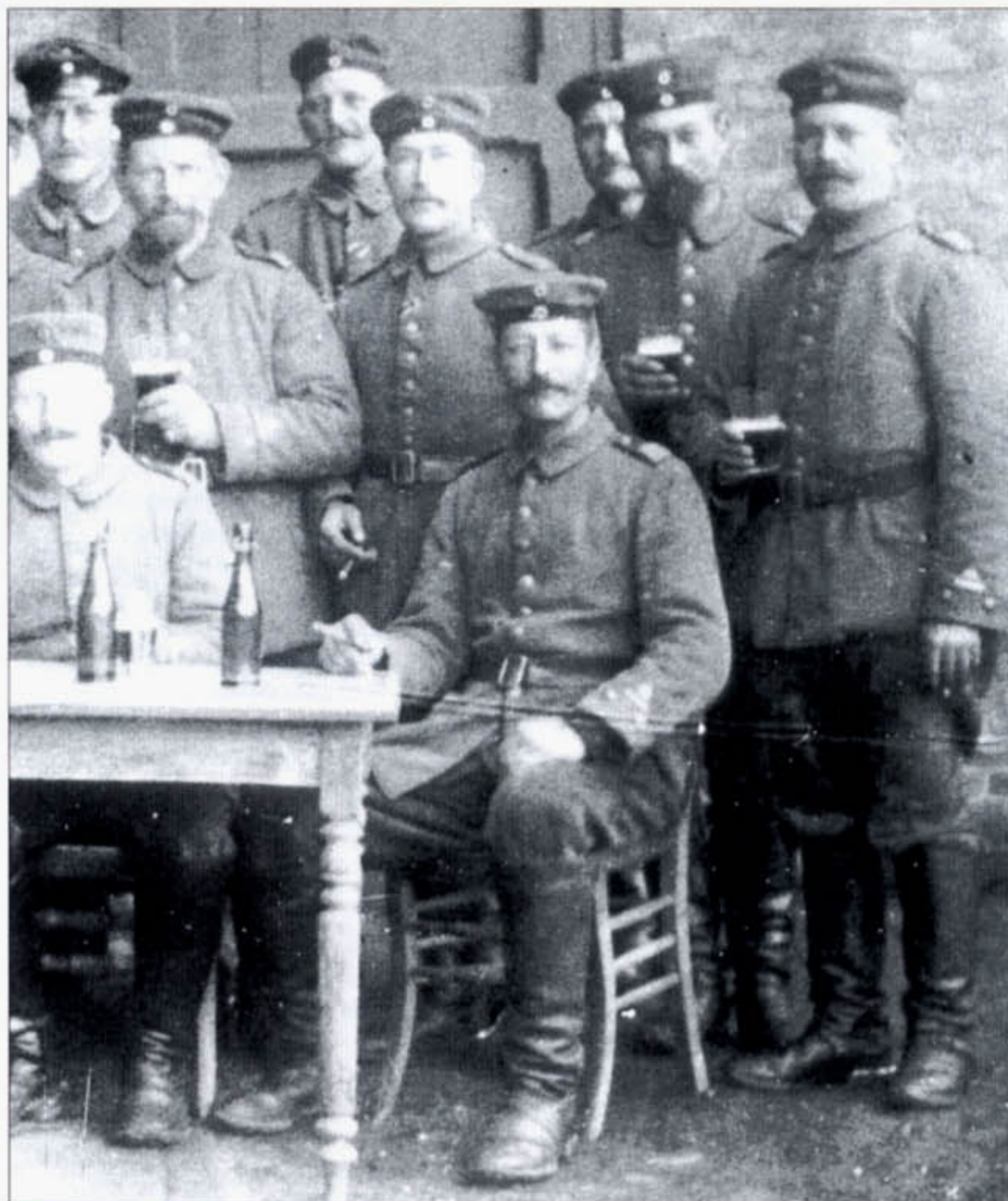
1917: men of the 267th Field Artillery Regt relax with a beer. As field artillerymen all wear M1915 field-grey breeches and M1915 standard cavalry boots with spurs, their M1915 peakless field caps with black bands and red piping. The M1907 field tunics have red M1915 shoulder straps with a yellow grenade and Arabic '267'. Note particularly, on the left forearms, the regimental sign – a white triangle above a bar – as part of the parent 208th Inf Div's quick recognition scheme. See Plate B1.

this division received it before the Armistice. The shoulder straps of his M1915 field tunic are rolled around the loops to conceal the regimental number. A previous act of bravery is marked by the Iron Cross 2nd Class buttonhole ribbon. Against regulations, he is wearing 'establishment' assault troop reinforced trousers, puttees and ankle boots. He carries a MP18/I Bergmann sub-machine gun with spare 'snail' magazines in a M1914 bread bag, a M1917 gas mask canister, P08 pistol, M1915 percussion stick grenades and a trench knife.