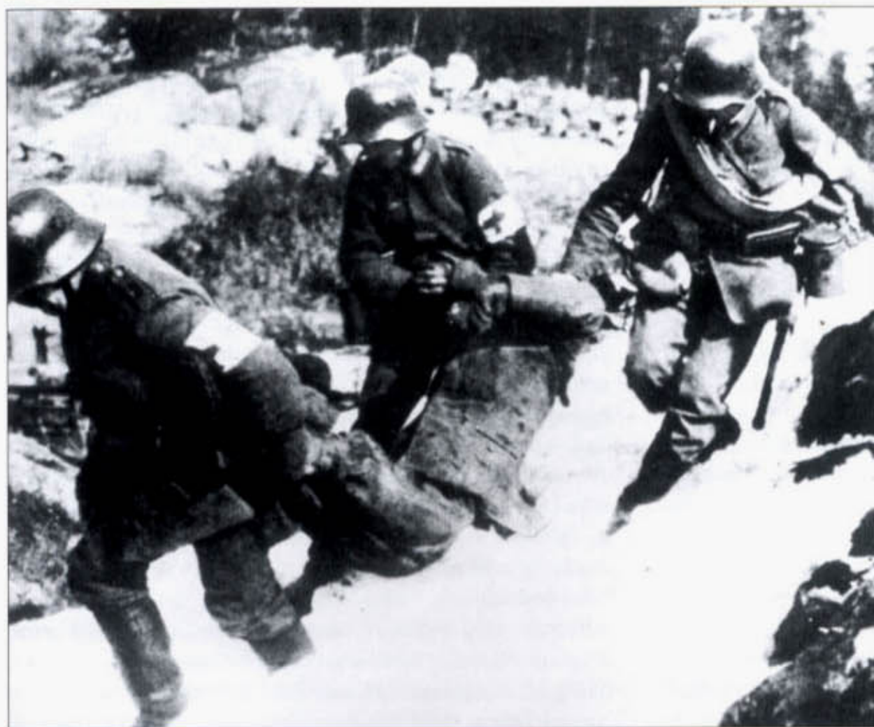
A group of stretcher-bearers from various units of the 12th Landwehr Div drag off a wounded civilian during the fighting against Communists in southern Finland, April 1918. They are wearing M1915 field uniforms with Red Cross armbands. The soldier at right carrying medical belt pouches is from 564th Medical Co, the other two are regimental orderlies.

The M1910 infantry officers' field-grey field uniform was introduced 2 May 1913 as the M1913