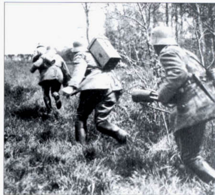
An assault troop charge through woods towards open ground. The Swedish cuffs and M1915 standard cavalry boots worn by the central soldier suggest dismounted Dragoons fighting as infantry. Note the concentrated charge carried by the soldier in the right foreground. (Author's collection)

forcing British 3rd Army back towards Amiens and almost destroying British 5th Army; but were halted at Albert and Noyon, having outrun their inadequate supply lines and lost 200,000 irreplaceable troops.