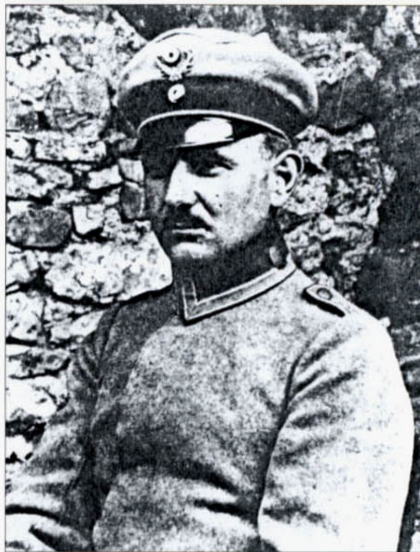
An Offizierstellvertreter was a sergeant or company sergeant-major temporarily acting as a platoon commander in the absence of a subaltern. This member of the 3rd Light Inf Regt from 200th Inf Div wears the M1915 NCO's peaked field cap in Jäger grey-green with a green band and crown piping and Prussian state cockade. Around the imperial cockade note the silver Carpathian Corps badge: splayed antlers and pine branches, with a short sword at bottom centre, bound by a scroll 'KARPATHEMKORPS'. Apart from the NCO Tresse braid and button of rank on the collar, his M1915 grey-green field tunic also has Tresse on the green-piped shoulder straps, to indicate his appointment.

A medical (veterinary) officer cadet (Unterarzt/Unterveterinär), attending the Berlin or Munich medical (Berlin veterinary) academy, wore the M1910 medical (veterinary) officers' uniform without collar patches and field-grey enlisted shoulder straps piped dark blue (crimson), edged in silver NCO braid with state-colour threads and a gilt Aesculapius staff. On the 1915/1916 medical (veterinary) officers' uniform he wore no collar patches but had M1915 grey NCO braid on the shoulder straps. From 6 Mar 1916 a medical (veterinary) officer cadet in his second clinical semester could serve at the front as a 'field officer cadet' (Feldunterarzt/ Feldunterveterinär), ranking as a sergeant, wearing the M1915/1916 uniform with NCO collar and cuff braid (often unofficially omitted) and