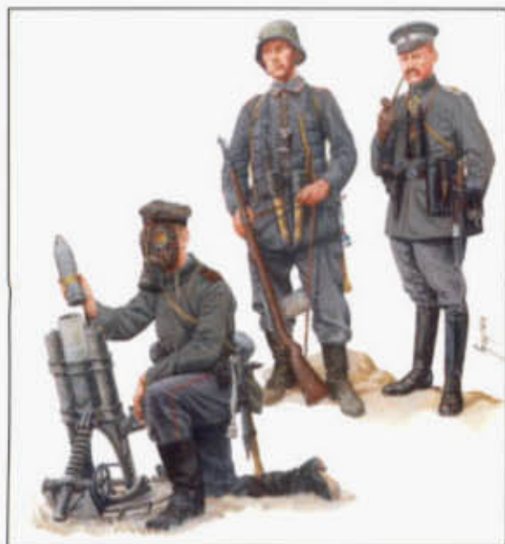
Full colour artwork

The uniforms, equipment, history and organisation of the world's military forces, past and present