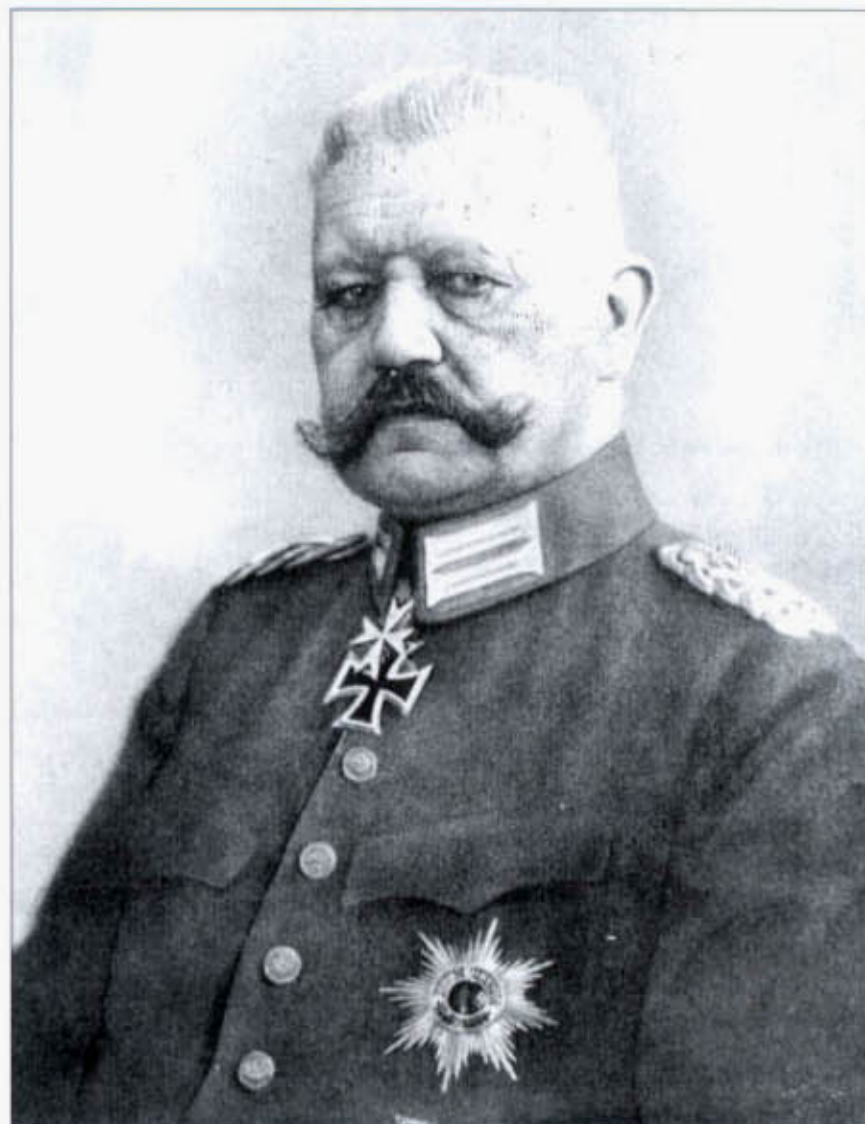
GFM Paul von Hindenburg, early 1918. Although real military and political power lay with his erratic deputy, Ludendorff, Hindenburg's bluff and avuncular image served to reassure most Germans. He wears his M1910 general officer's field tunic with the lemon-yellow collar patches and Guards Litzen (braids) of the 3rd Foot Guards, of which he was colonel-in-chief; the field-marshal's shoulder boards also have yellow regimental underlay. At his throat are the Grand Cross of the Iron Cross (awarded 1916) and Pour le Mérite with Oakleaves (awarded 23 February 1915); the breast star of the Order of the Black Eagle is worn above the Iron Cross 1st Class.