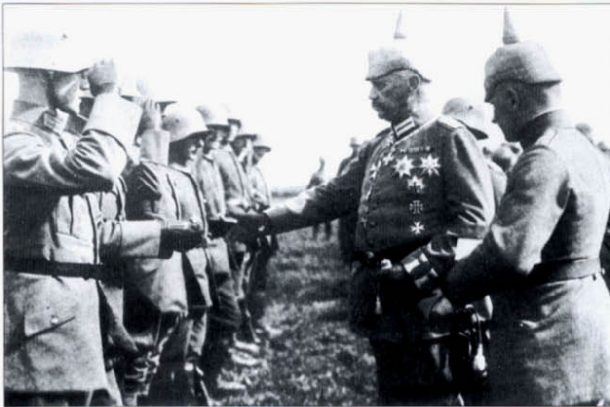
GFM von Hindenburg awarding Iron Crosses 1st Class after the Spring Offensives, August 1918. He wears the M1915 full dress uniform of the 3rd Foot Guards with all his orders and decorations; note the Star of the Grand Cross of the Iron Cross, an Iron Cross surrounded by silver rays, awarded to Hindenburg in March 1918 following the German breakthrough at Arras. The Guards officers (left) are wearing M1915 field tunics with Guards collar braids and M1916 steel helmets.