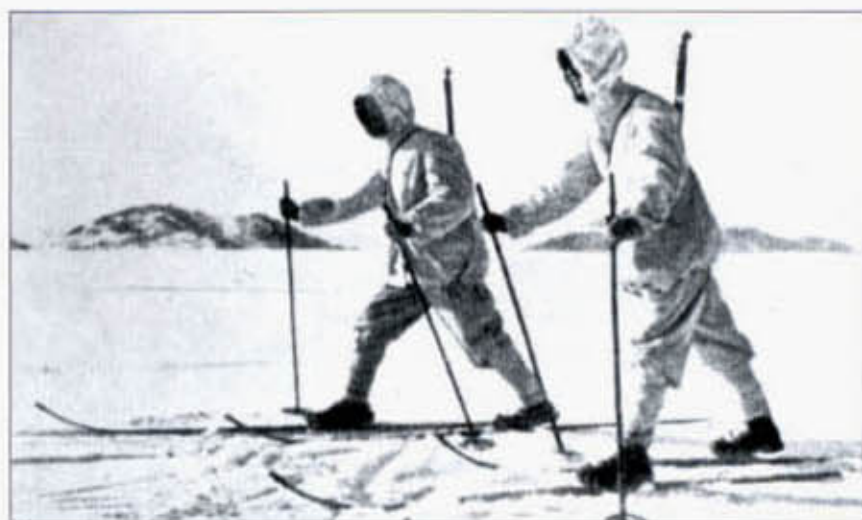
Two members of either the 3rd or 4th Bavarian Ski Bns, 3rd Light Inf Regt, serving with the 200th Inf Div probably in Rumania, 1917. They wear the M1915 hooded windproof jacket reversible from drab green to white, and the matching trousers secured by integral puttees.

The Armistice ushered in a period of intense upheaval, as Germany and her neighbours reacted to the collapse of German power. Many German units marched back to the Reich in good order, rightly claiming that they had been undefeated in the field, but