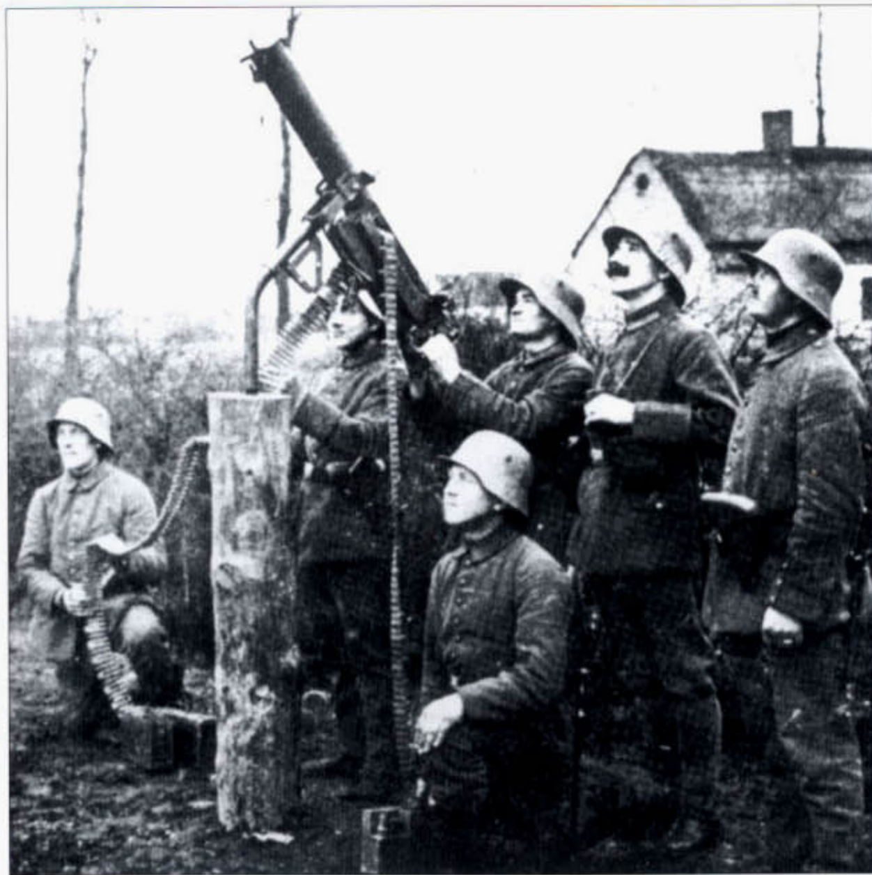
A six-man crew operating a MG08 heavy machine gun mounted for anti-aircraft fire. The corporal commander (second right) has abbreviated NCO collar Tresse on his M1915 tunic; the others wear M1907 or simplified M1907 tunics. Note the holstered P08 pistols issued to machine gun crews; and that the soldier at right is wearing his trousers loose over his marching boots.

A 5,238-strong mounted Cavalry Division had an HQ and HQ Troops comprising an engineer detachment, signals detachment, medical company and two veterinary hospitals. There were three cavalry brigades, each with two cavalry regiments, a regiment having four sabre and one light MG squadrons; a Jäger battalion (four Jäger, two MG, one cyclist and one light mortar companies); and a horse artillery battalion. A Cavalry Rifle Division had three 'commands' (corresponding to cavalry regiments), each with four rifle and one light MG squadrons; a mounted squadron, a field artillery regiment and an engineer battalion.