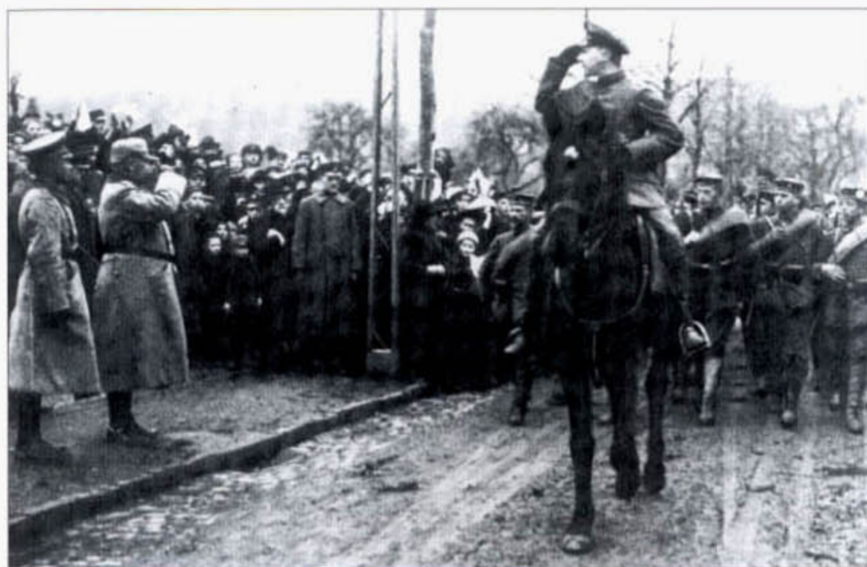
The German Army used the months between the Armistice of November 1918 and the Treaty of Versailles in June 1919 to shift the blame for defeat away from the exhausted German troops, many of whom were in open revolt, and towards the politicians who were attempting to salvage a demoralized nation – the myth of the 'stab in the back'. The Entente unwittingly encouraged this by allowing units to march back to their barracks with colours flying. Here infantry from the XI Corps District parade with perfect discipline at GHQ in Kassel past the supreme commander, GFM von Hindenburg.