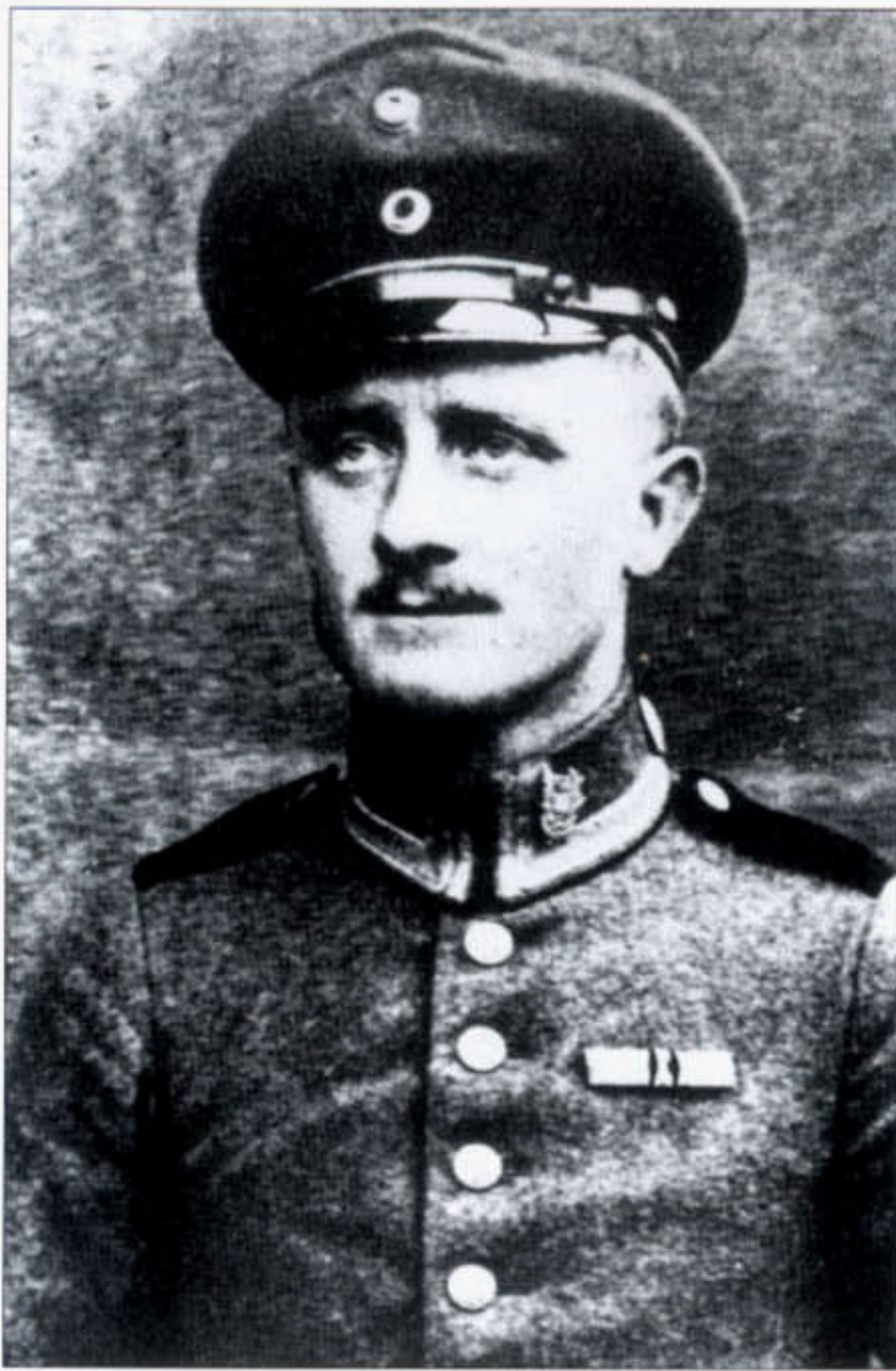
This company sergeant-major from the 20th Bavarian Engineer Bn, 8th Bavarian Reserve Div, wears the Bavarian state cockade on the red-piped black band of his M1907 peaked field cap. His M1907 field-grey tunic has the Tresse collar edging and large heraldic side-buttons of his rank, with strips of light blue and white 'Bavarian cord' on the front edges only, as ordered from December 1917. The M1915 engineer shoulder straps in black had red piping and a red battalion number, although they appear as solid black in this photograph. Note on his left collar only this division's unofficial badge: the Bavarian national shield set on two silver holly leaves.

On 20 June 1915 members of the Alpenkorps who had served on the Tyrol front, May–Oct 1915, were awarded the M1914 Austro-Hungarian Edelweiss cap badge: a silver-grey metal flower with yellow stamens, worn on the M1915 spiked helmet, M1895 light infantry shako, M1910 officers' peaked field cap or M1907 enlisted peakless field cap, just above the left ear.