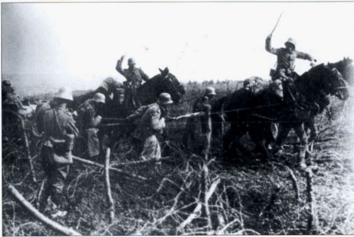
The entire personnel of a field artillery gun crew help the team drag a C96 n/A 7.7cm field gun and its limber through a gap in the enemy wire during the German advances of spring 1918.