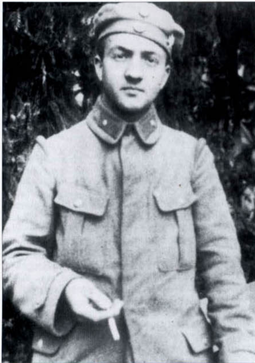
Private of the Württemberg Mountain Bn, wearing the M1915 peakless field cap with a fashionably crushed crown, with the black and red state cockade on the front of the green band and the Edelweiss badge on his left. His modified M1914 ski Litewka shows the green shoulder seam padding, and green collar patches with a button displaying the company number, 1-6. See Plate F2.

Gewehr 98. Note two M1916 stick grenades and a trench knife on his belt, a field flashlight, and the 8th Company bayonet knot.