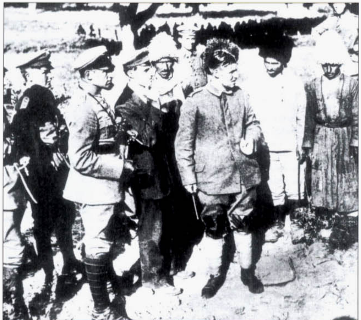
Members of the German Mixed Brigade in Georgia, June 1918, talk to local tribesmen. The second lieutenant (second left) wears a khaki M1900 tropical peaked cap and M1916 officers' tropical tunic and trousers. The corporal (centre) has a M1915 field-grey field tunic, his M1914 reinforced mountain trousers suggesting that he is from the 10th Assault Bn, which served on this front.

In Apr 1917 there were 190 Reserve infantry regiments: 148 Prussian (1, 2 Gds; 1-441 series); 13 Saxon (110 Gren; 101-4, 106, 107, 133, 241-245); 7 Württemberg (119-122, 246-248); and 22 Bavarian (1-8, 10-23 Bav). However, with the disbandment by Nov 1918 of 28