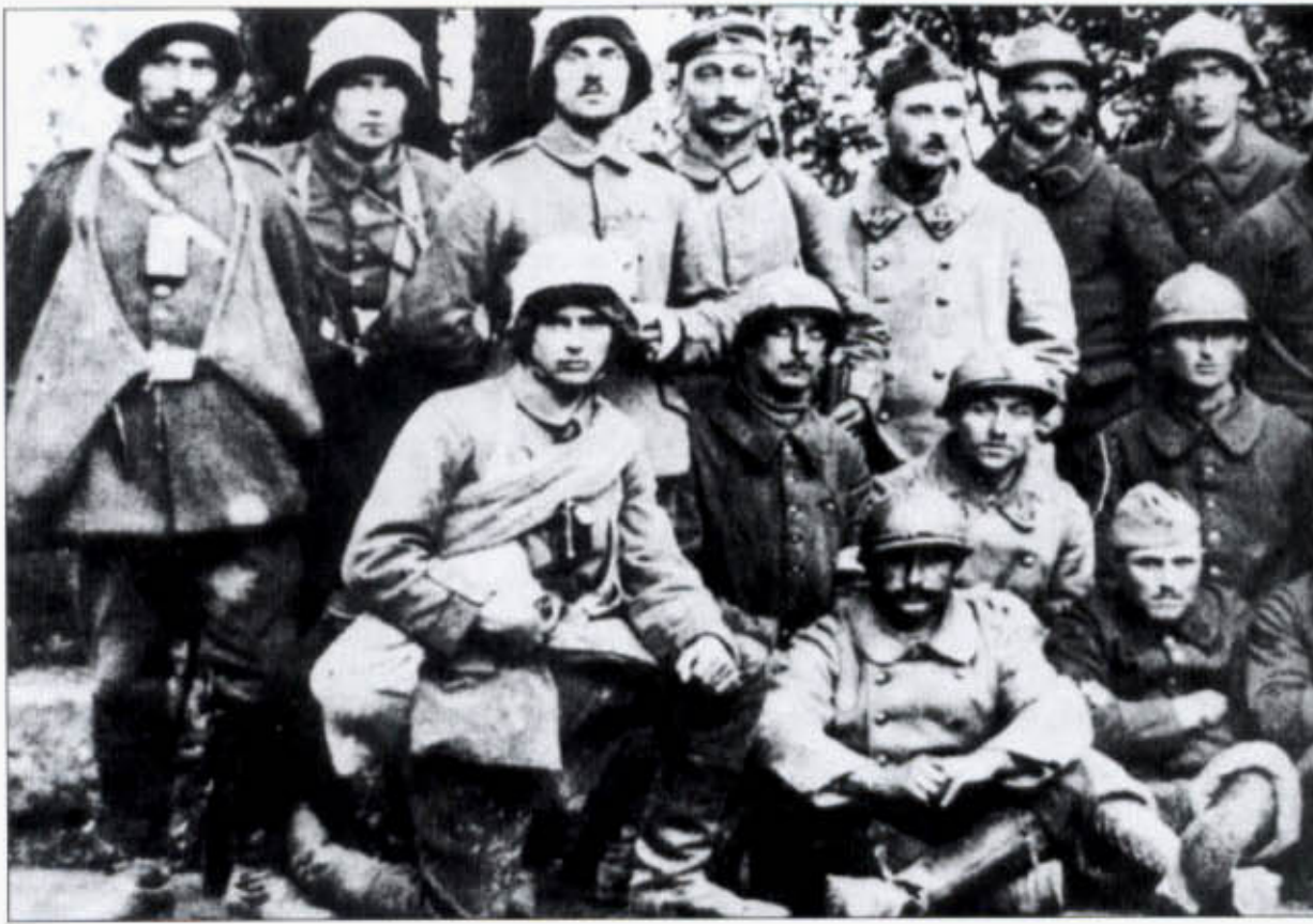
Six members of an assault troop pose proudly with a group of dejected French prisoners they have just captured. Some troopers have field-made cloth helmet covers; M1907 infantry field tunics are worn with M1917 trousers, M1866 marching boots or puttees with M1912 ankle boots. They carry locally made grenade sacks, and the corporal (left) has a field torch suspended from a front button.

senior NCOs; junior NCOs and men continued to wear the inelegant M1907 enlisted men's peakless field cap in coarse field grey wool with a band in finer red facing cloth; they could add a field-grey soft leather peak at their own expense.