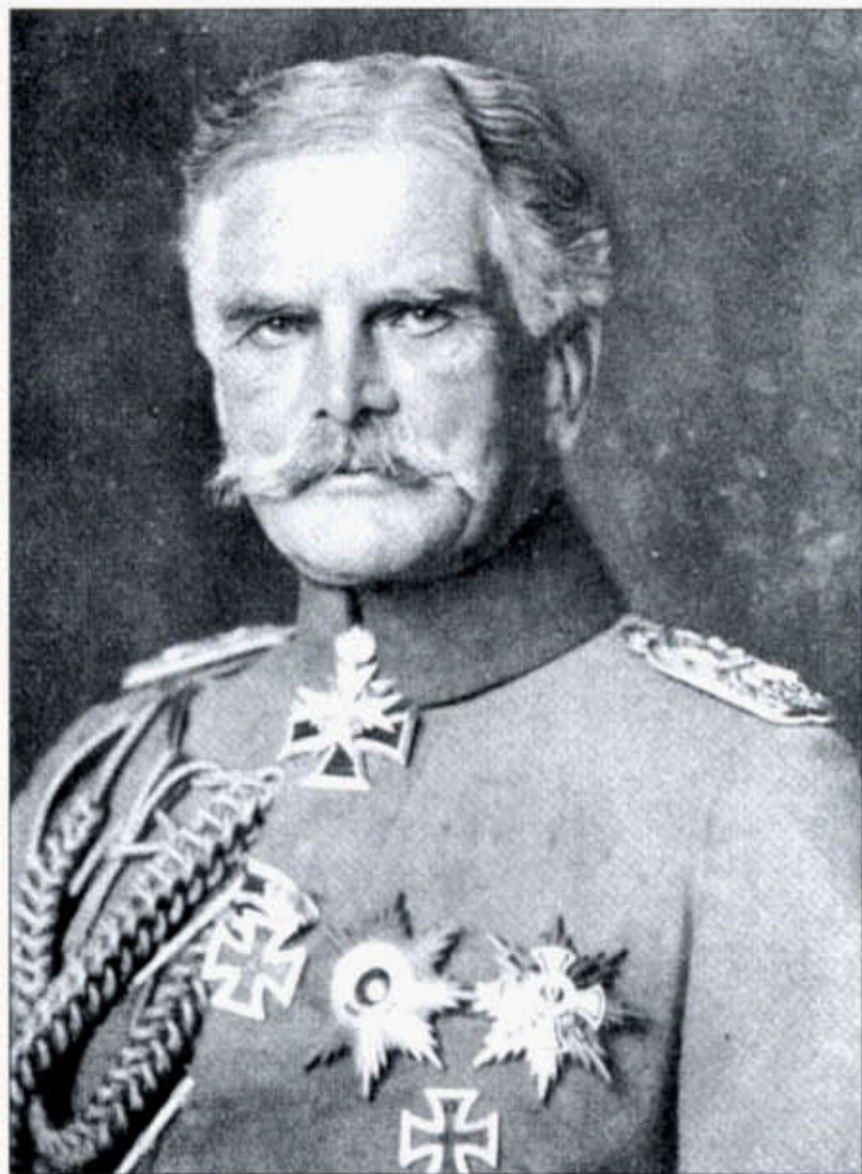
GFM August von Mackensen (he claimed Scottish ancestry) epitomized the dashing cavalryman in an age of mechanical warfare. He was the longest serving Army Group commander, gaining spectacular victories in Poland and Serbia in 1915 and Rumania in 1916, and rivalling Hindenburg in national prestige. Here he combines two uniforms, with the freedom typical of a senior general. As colonel-in-chief of the 129th Inf Regt (3rd West Prussian) he wears an officers' M1915 field tunic, and field-marshal's shoulder boards with the lemon-yellow regimental underlay and silver regimental number. As an ADC to the Kaiser he wears gold wire aiguillettes, and a gilt crowned 'W' superimposed on the field-marshal's batons on his shoulder boards; but he has omitted the ADC's 'Kolben' collar braids. His neck decorations are the Pour le Mérite with Oakleaves (awarded 3 June 1915) and the Grand Cross of the Iron Cross; among his breast decorations (right) is the star of the Order of the Black Eagle.

The Wound Badge was instituted on 3 Mar 1918: a breast badge depicting a steel helmet over crossed