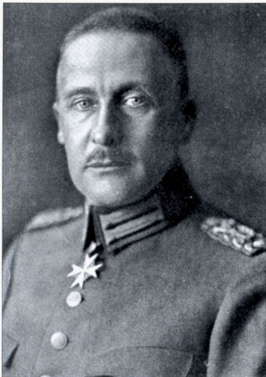
GFM Albrecht, Duke of Württemberg, represented the Württemberg monarchy as commander of the 4th Army facing British and Belgian forces in Flanders, and later as Army Group commander in the Vosges. As colonel-in-chief of the 119th Grenadier Regt 'Queen Olga' (1st Württemberg) – his state's senior infantry regiment – he is wearing the M1910 general officers' field tunic with the regimental Guards collar braids, and field-marshal's shoulder boards with a silver crowned 'O' cipher and Württemberg infantry red underlay. He was awarded the Pour le Mérite on 27 August 1915 following the Second Battle of Ypres, and the Oakleaves on 25 February 1918.

'Linsingen' (Gen d.Inf Alexander von Linsingen) defended south-western Byelorussia with the German Bug Army and 4th Austro-Hungarian (AH) Army against the Russian South-West Front. On 31 March 1918 it was redesignated the 'Eichhorn-Kiew' Army Group (GFM von Eichhorn), from 1 May 'Eichhorn', and from 13 August 1918, following Eichhorn's assassination, as 'Kiew' (GenObst von Kirchbach).