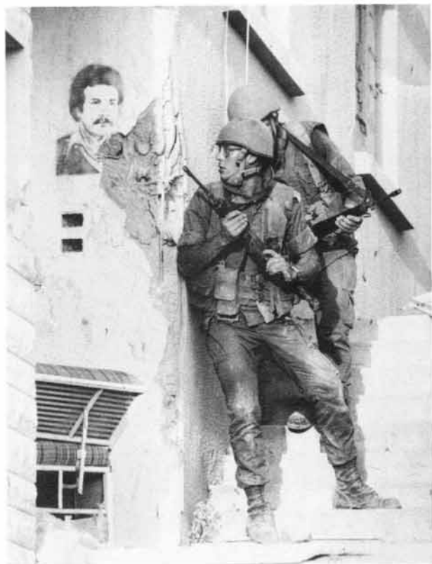
Urban warfare in West Beirut, August 1982. PLO and Mourabitoun guerrillas hid and fought everywhere, and apprehension is apparent on the faces of these two Golani soldiers. The lead man wears an IDF Kevlar flak jacket, and his companion an American M1952 type; both are armed with M-16s.

at him: 'We're here with tanks! Do something! '