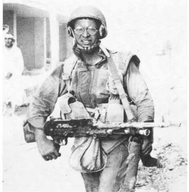
South Beirut, August 1982: this Golani machine gunner ('MAGist') wears the Israeli Kevlar flak vest and helmet, and carries his weapon's ammunition belt in its shell collector bag, a common IDF practice. The MAG's bipod is also wrapped in hessian, affording a handgrip when firing the weapon from the hip.

Lebanon achieved its independence in 1943, after years of French rule under a League of Nations Mandate that dated back to the First World War. The country, formerly part of Syria, embraced a wide variety of religious and ethnic groupings, all mutually antagonistic. The most important were Maronite and Greek Orthodox Christians, and Sunni and Shia Muslims, together with members of the secretive Druze sect. The government was structured by an agreement known as the National Covenant, which was supposed to divide power proportionally among the various factions. This resulted in a weak central government ill-equipped to merge the rival groups into a truly national state. However, the National Covenant served the country fairly well for nearly 30 years, despite the problems of urbanisation and rising Muslim demands for greater representation. In the end, it was not a Lebanese issue that destroyed it, but the problem of the Palestinians.