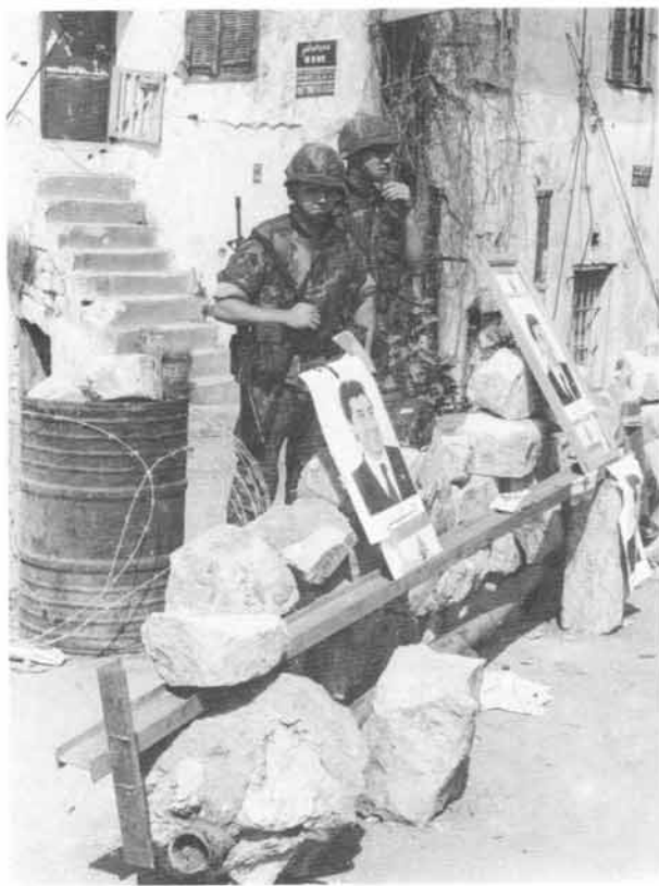
US Marines of the 32nd MAU survey a Phalangist road block decorated with posters of Bashir Gemayel; Beirut, September 1982.

ambush. The tour in progress in October 1983, codenamed 'Diodon IV', involved 3 e RPIMa, detachments from several other units, and a régiment de marche assembled specifically for service in Lebanon in September 1983. Formed from conscripts who volunteered for extended service in Beirut, it drew companies from several other paratroop units and received the temporary designation '6 e Régiment d'Infanterie Parachutiste'. It was this unit which was the target of the 23 October suicide bombing, which cost the lives of 58 French soldiers, mostly members of 3 e Cie., 1 er RCP (Régiment de Chasseurs Parachutistes). Men of 3 e RPIMa helped dig out their crushed bodies.