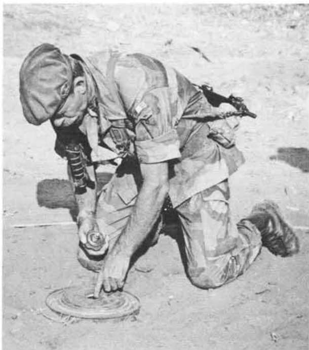
Italian 'Folgore' paratrooper disarming a mine near the Sabra and Shatila Palestinian camps. He wears a dark red beret with the paratroopers' winged parachute and sword badge, and Italian pattern camouflage fatigues (cf. Plate H2). These have padded reinforcements at shoulder and knee and—not apparent here—tightening straps below the knees. Again, note small rectangular national flash worn by all units except the 'San Marco' Marines.

A company-sized British contingent served with the MNF from February 1983 to February 1984. The original unit was C Sqn., QDG, replaced from