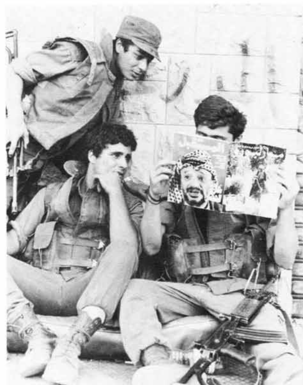
Israeli paratroops enjoy a captured PLO magazine, near Damour, June 1982. One man wears the old-style IDF fatigue cap. Also note the IDF's method of boot lacing.

Meanwhile, in August 1983, Israeli forces unilaterally withdrew from the Shouf Mountains to positions on the Awali River. Their place was to be taken by the newly revitalised Lebanese Army, American-equipped and American-trained. The transition did not go as planned, and the Druze forces engaged in bitter fighting against the government's troops. The United States had now