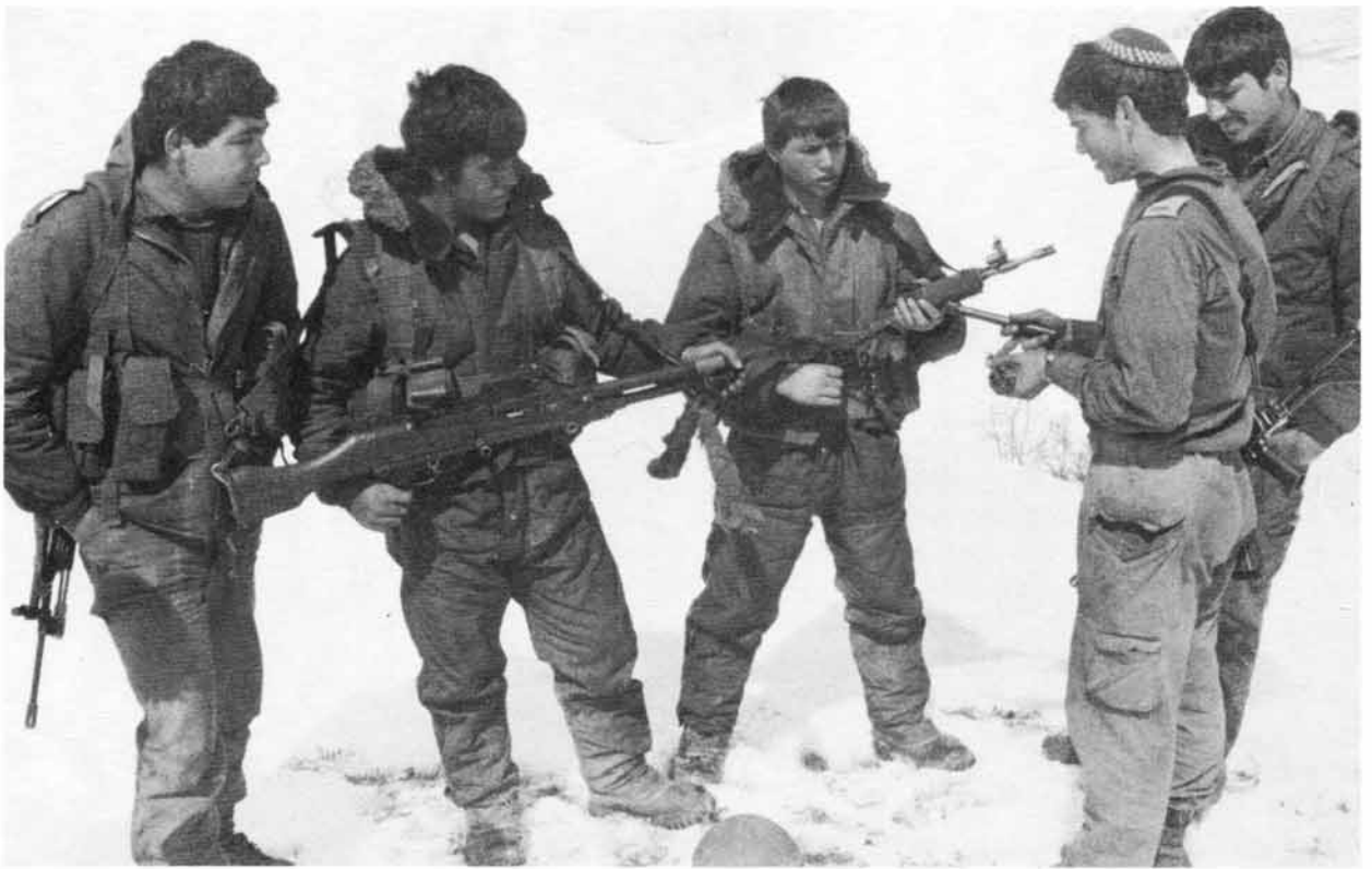
IDF combat engineers present their weapons for an officer's inspection, prior to a patrol near Aley, January, 1983. The man on the left wears the IDF's winter parka and a captured 'woolly pully' sweater (the PLO used both British and Pakistani Army patterns). The two soldiers in the centre wear the IDF 'snowsuit' and 'Hermoniot' winter boots.

Forces retaliated with land, sea and air attacks on these PLO bases.