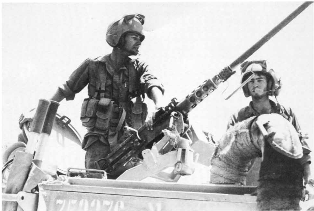
An Israeli M-113 crew of Peled's Special Manoeuvre Force near Yanta, Beka'a Valley, July 1982. They wear OR-601 tanker's helmets, the oldest of the three patterns of CVC helmets used by the IDF.

the Syrian artillery fire intensified. The battalion commander radioed for air support; this never arrived, and the unit also suffered the indignity of a Syrian air strike by two MiGs. With ammunition running low, the Israeli battalion made a dash for it, supported by artillery, and escaped. The unit had suffered heavy casualties, and a number of its vehicles had been left behind. There had been no time to destroy them, and the Syrians were able to tow away the M60s with much of the secret equipment aboard still intact.