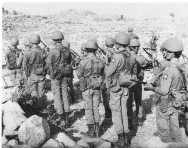
Christian Phalange troops in training in the Shouf Mountains, 1983. They are completely clothed and equipped by the IDF, from helmets to combat boots, and are armed with AK-47 and M-16 rifles. The shoulder patch is that of the Phalange's 'Lebanese Forces'.

In the eastern sector, things were relatively quiet.