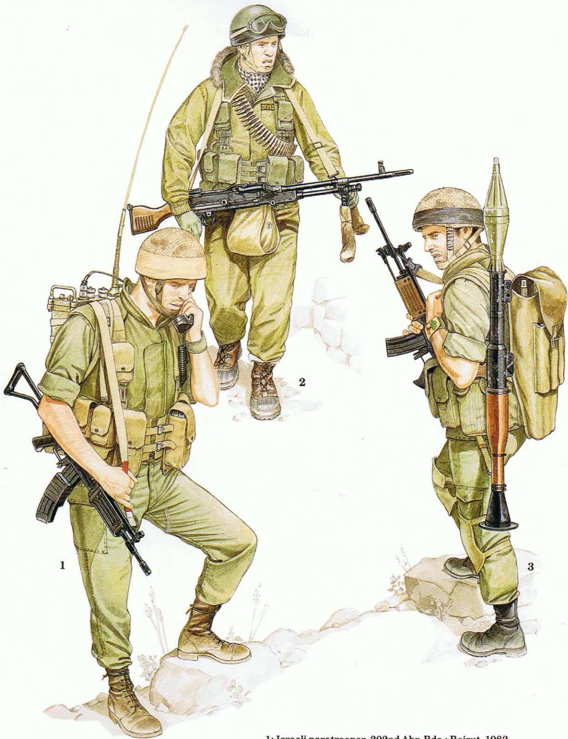
1: Israeli paratrooper, 202nd Abn.Bde.; Beirut, 1982 2: Israeli paratroop 'MAGist'; Shouf Mts., Feb.1983 3: Israeli infantryman, Golani Bde.; S.Lebanon, June 1982