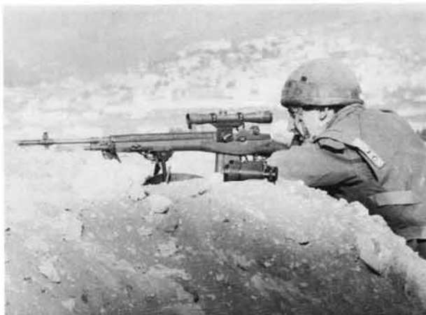
Israeli Golani sniper near Beirut, August 1982. The M-21 ('accurised' 7.62 mm M-14) was the standard IDF sniper's weapon during the Lebanon war. This particular weapon has been modified by the addition of a bipod, apparently one from a sniper's version of the Galil.

In the central sector, Einan finally broke through to Ain Dara overlooking the Beirut-Damascus Highway, which the Syrians stubbornly defended with their 62nd Brigade. With air superiority assured, however, Einan called in Israeli helicopter