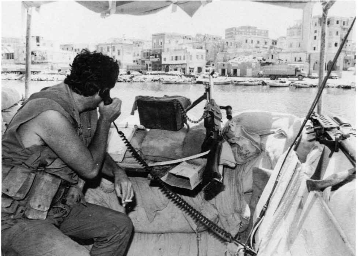
An Israeli naval reservist scans the ruins of Tyre, June 1982. An MAG machine gun and an M-16/M203 rifle/grenade launcher lie close at hand as he speaks over an Israeli Mk.25 field radio. Note shell collector bag alongside the machine gun.

The PLO-leftist Muslim-Druze alliance was too much for the Christian forces to handle and, in February 1976, they gave tacit support to a Syrian and Lebanese plan to end the fighting by granting concessions to the Muslims. The PLO refused to go along with the plan, however, hoping to achieve their own national state, or at the very least to gain total control of south Lebanon. As the war entered