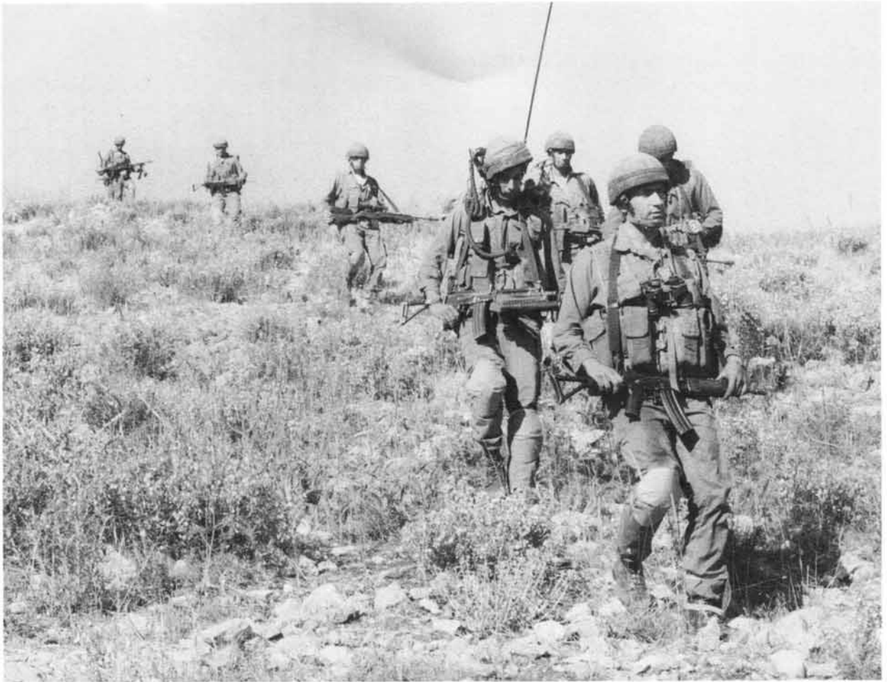
Israeli patrol in the Beka'a Valley, November 1982. The radioman carries, in addition to his Mk.25 radio, an unusual Gilon/M203 SAR/grenade launcher combination. Further back in the column, another man is armed with an M-21 7.62 mm sniper rifle and scope.

the country 1 . Instead they remained, consolidating their power bases in Beirut and in the Beka'a Valley in eastern Lebanon. Following the signing of a peace treaty between Egypt and Israel in 1980 Syria's relations with the PLO improved; the Syrians withdrew from the coastal region, turning over control to the PLO. By 1981 the Syrians were in control of two-thirds of Lebanon; ousting them had become a major goal for the Christians.