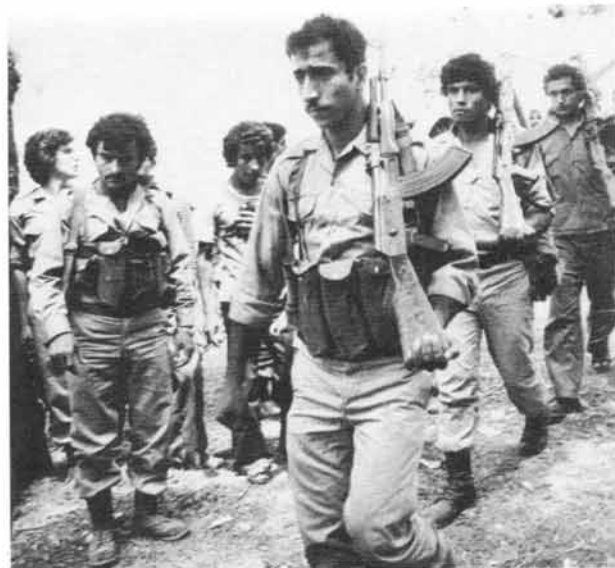
Fighters of a Main Force PLO (Fatah faction) unit near Nabatiyeh, a month before the Israeli invasion. They wear both green and pale khaki fatigues with high-topped commando boots, and are armed with AK-47s and (extreme right) an RPD LMG. Note Chinese stick grenade tucked into a side pocket of the nearest man's PLO/Syrian chest pouch.

This 'Shoter Tzvai' (military policeman) wears standard IDF fatigues with the new issue Kevlar flak vest. Although this is now the main issue, many rear echelon units wore the older American M1952 type in Lebanon. The white-painted helmet is the Israeli version of the US M1; both it and the brassard bear the Hebrew letters 'mem' and 'tzadeh'