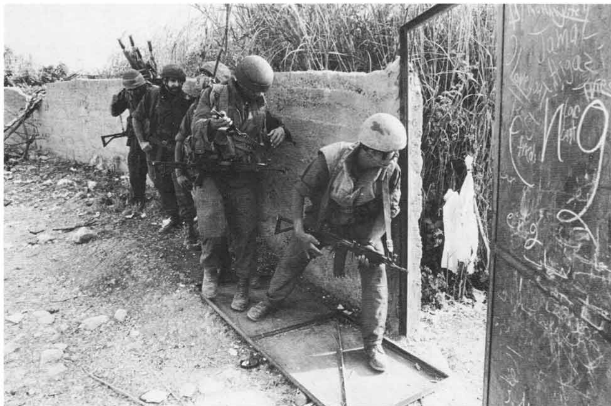
Israeli forces search for PLO terrorists at the El Baas refugee camp near Tyre, June 1982. The lead soldier, peering cautiously around a graffiti-covered wall, carries a Gilion and wears an American M69 flak vest. The man at the rear carries a folding stretcher attached to a US Army packboard.

Before their departure, the Israelis had also established a small Christian and Shi'ite militia under the command of former Lebanese Army Maj. Saad Haddad. Completely armed and financed by the Israelis, it reached a peak strength of 2,000 men. (Haddad, a Greek Catholic, was despised and reviled by the Maronite leaders, both for his co-operation with Israel and for his use of Muslims in his militia.) This was sufficient to protect Haddad's small enclave and part of the border, but could not seriously challenge the PLO. In 1981 the PLO stepped up the pressure with massive rocket and artillery attacks on the border towns of northern Galilee. The situation soon became intolerable; there were many civilian casualties, and Israeli citizens were becoming hostages of their bomb shelters. Even after US Special Envoy Philip Habib managed to mediate a ceasefire between Israel and the PLO, the Israelis began to consider several military contingencies to evict the PLO from Lebanon once and for all.