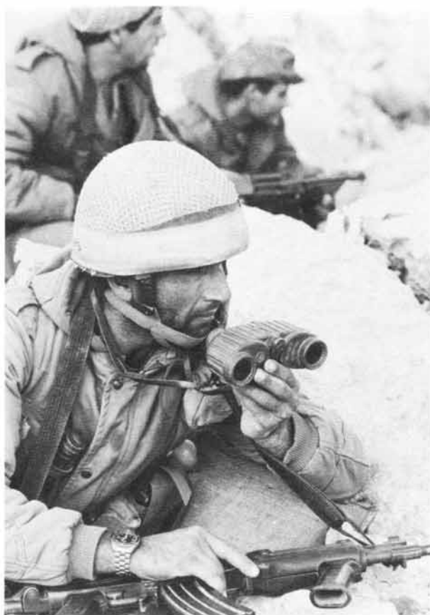
Members of the elite IDF Druze reconnaissance unit observe Syrian positions in the Beka'a Valley, November 1982. Web gear is worn over winter parkas, with helmets or fleece-lined caps. The nearest man is armed with the Glilon SAR with attached forward pistol grip, and also carries an American Kabar combat knife on his webbing.

By January 1984 the Lebanese Army had been defeated by the Druze and Shi'ite militias, and had split along factional lines. As Druze and Shi'ite forces pushed down from the Shouf and took control of South and West Beirut, the Lebanese Army fell apart. The Muslim troops deserted to the militias, while the Christians, trapped south of the city, streamed south across the Awali River, seeking sanctuary behind the Israeli lines. Amin Gemayel's status had been reduced effectively to