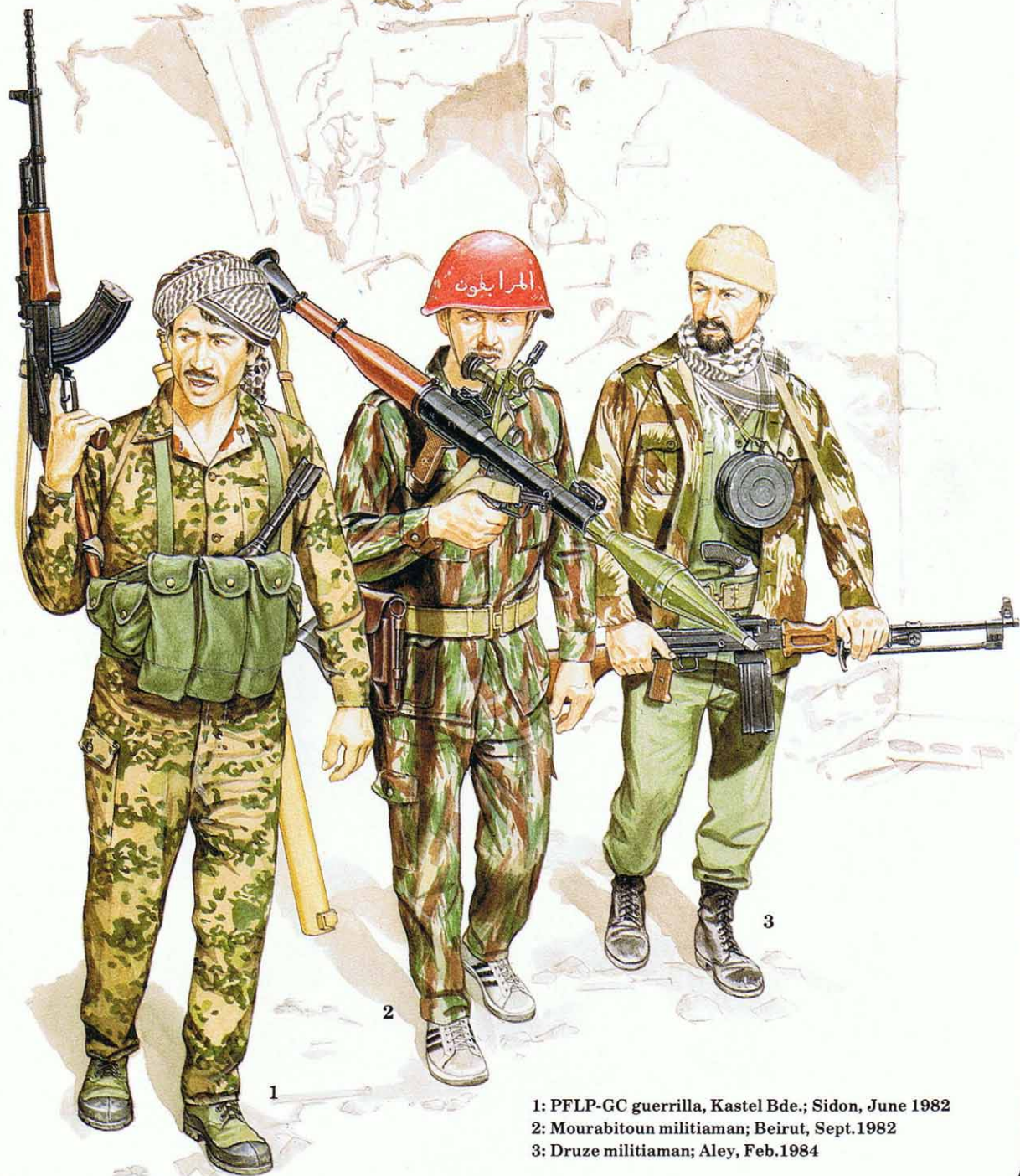
1: PFLP-GC guerrilla, Kastel Bde.; Sidon, June 1982 2: Mourabitoun militiaman; Beirut, Sept. 1982 3: Druze militiaman; Aley, Feb. 1984