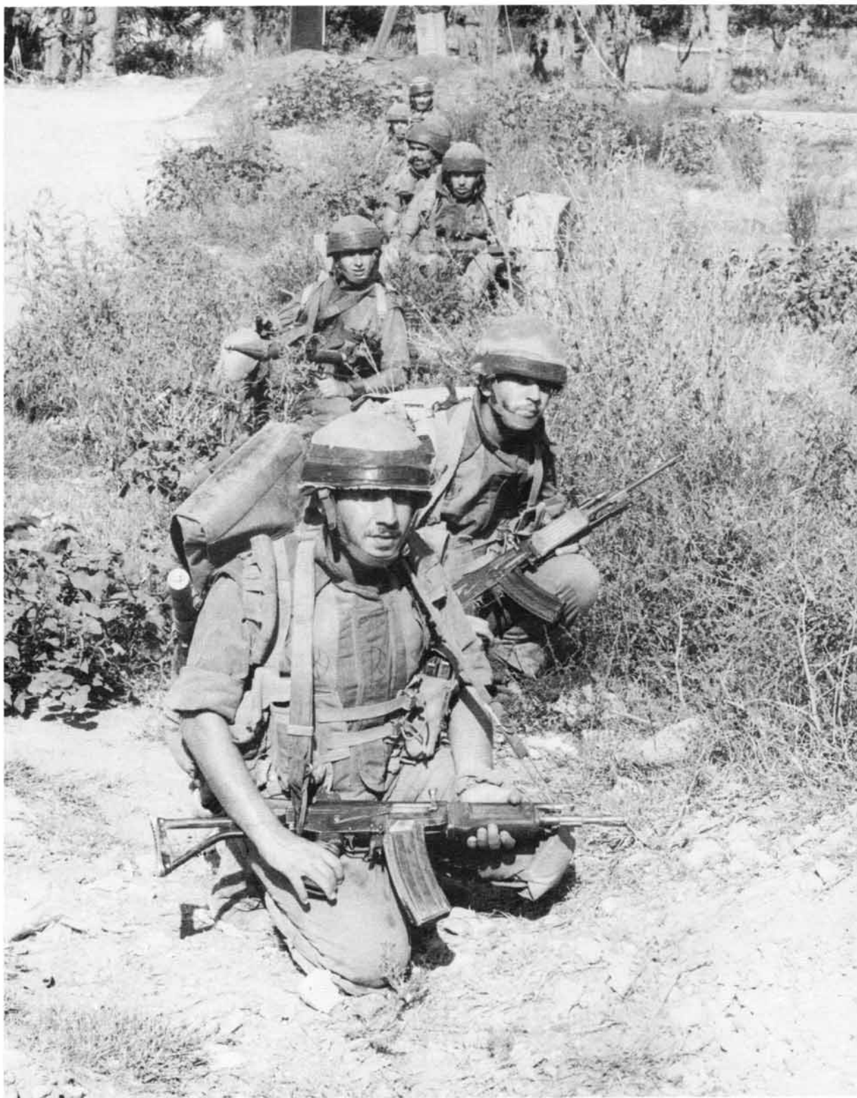
Israeli paratroops await the order to advance; east of Beirut, July 1982. Helmet netting is held in place by bands of inner tubing, and the lead man has taped two magazines together for

his Glilon SAR (Short Assault Rifle). Also note his RPG bag.