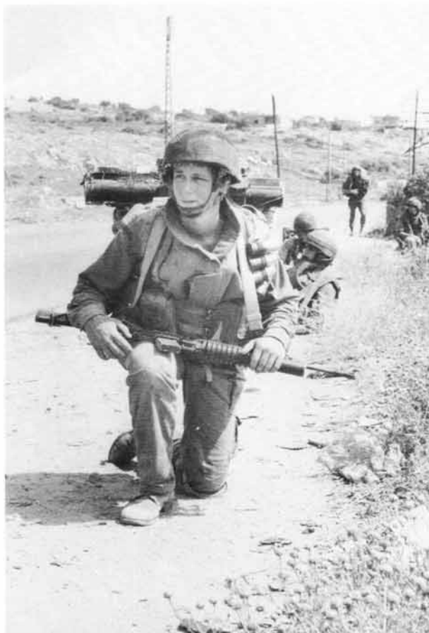
An Israeli paratrooper pausing on the road to Beirut, June 1982. An M-72 LAW anti-tank rocket is strapped to his pack. He has also improvised his own way of carrying the 40 mm rounds for his M-16/M203 combination.

The bizarre behaviour of Syria in Lebanon can only be understood by reference to past history. Syria never accepted the partition of the country under