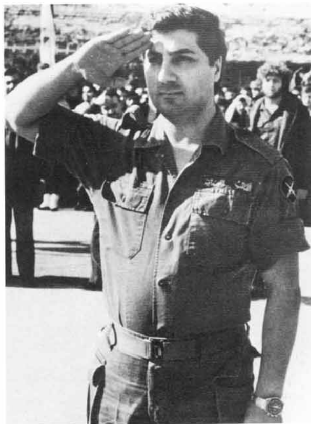
Phalangist leader Bashir Gemayel in Christian East Beirut, May 1982. Already, at the age of 34, an experienced politician and militia commander, he had by this time ruthlessly suppressed all opposing Maronite factions to make himself sole leader of Lebanon's Christian community. His later assassination while President-Elect was to have bloody consequences for all of Lebanon. In this photo, taken at a military ceremony, he wears IDF fatigues with 'Lebanese Forces' nametape; his shoulder patch is that of a command unit of his militia (see Plate D1).

latest American BDU camouflage uniform is worn with Israeli fatigue cap, boots and web gear. It is very difficult to track down the origins of all these odds and ends. In addition to aid from the Israelis, the Christians purchase a large part of their supplies on the open market, and also make use of captured enemy stocks. The brown Israeli paratroop boots are also interesting: even though many Lebanese Forces personnel were trained in Israel, few, if any, became parachute qualified. However, as the boots evoke 'elite force' status, they have become a favourite among the Phalange forces. The M-16 rifle is the main issue within this Christian army. This particular example is fitted with a small 3-power optical sight. He also has a Smith & Wesson revolver in a black leather holster. In Lebanon, where weapons are considered a sign of machismo, the more weapons carried, the greater the individual's prestige.