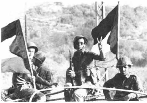
Syrian units of the Palestinian Liberation Army (PLA) withdrawing from Beirut, 23 August 1982. (These are auxiliary troops of the Syrian Army, and not PLO fighters.) They wear Soviet steel helmets and green fatigues. The centre soldier is equipped with one type of indigenous Syrian Army web gear, including two AK magazine pouches, a smaller pouch for the weapon's oiler and cleaning kit, and canteen with carrier.

affectation is the Golani Brigade insignia worn on the wristwatch cover band.