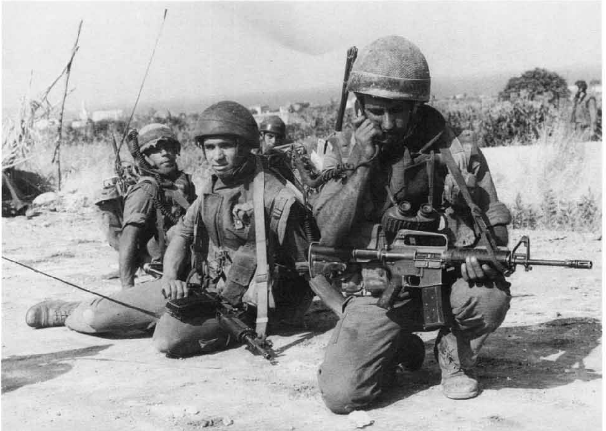
Israeli patrol near Damour, June 1982. The officer's CAR-15 is fitted with current-pattern flash suppressor, Israeli-made plastic magazines, and 'rosebud' attachment for firing anti-tank grenades.

Three basic plans were proposed by the IDF. First, a repeat of Operation 'Litani'; second, a larger-scale operation codenamed 'Little Pines', which called for Israeli forces to occupy a zone 40 km deep north of the Israeli border to keep the PLO out of artillery range of northern Israel; and third, 'Big Pines', which called for Israeli forces to go as far as Beirut, forcing the PLO to either stand and fight or withdraw from Lebanon entirely. The first proposal was immediately discarded, and debate centred on the remaining two. 'Little Pines' was the least risky politically; but the larger plan had much to recommend it, especially since the Phalangists had promised their full military co-operation in rooting the PLO out of Beirut itself, should the Israelis advance that far. Bashir Gemayel's personal assurances convinced many top Israeli leaders, including Prime Minister Begin, Defense Minister Ariel 'Arik' Sharon, and IDF Chief of Staff Lt.Gen. Rafael 'Rafal' Eitan. However, many officials in both the Israeli government and IDF military intelligence opposed such collusion with the