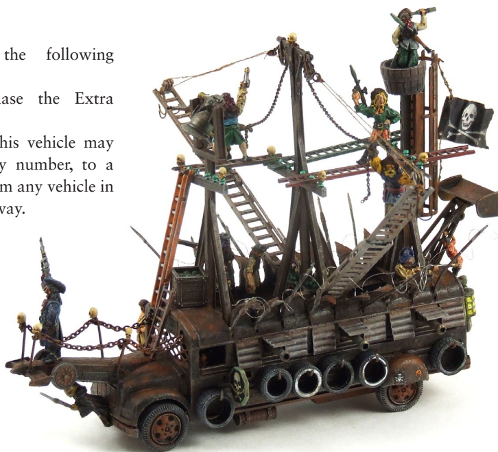
Black Jake's Revenge by Jake Zettelmaier

Press Gang or Keelhaul: When another vehicle in contact with this vehicle is wrecked, this vehicle may gain either 1 crew or 2 audience votes.