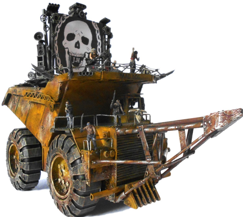
The Mad Dog by James Hall

When this vehicle makes a shooting attack with a Mortar, it may choose to roll 0 attack dice to instead make a 2D6 explosion attack against every vehicle within medium range of the target vehicle, including the target vehicle.