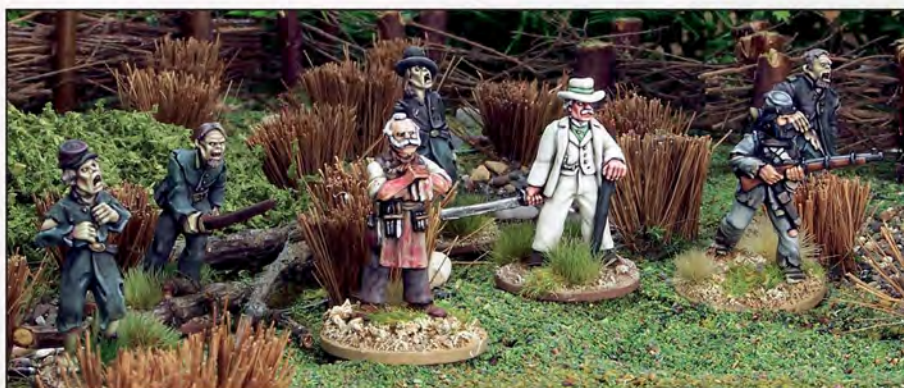
OPPOSITE Denizen of the Swamp: Loup Garou