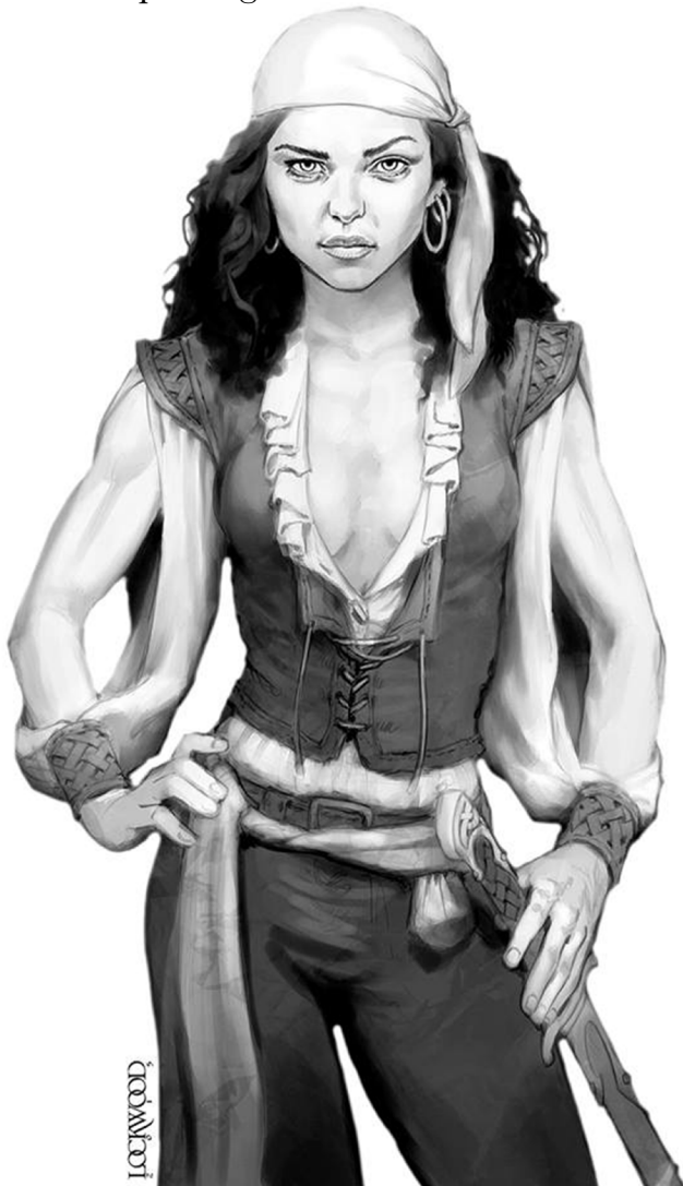
‘Torrent, a Corsair, was never far from trouble in mighty Taux’.

To create something unique, I decided to bind each primary race in the Nameless Realms fiction to a certain element. Some had strong ties, some not so much, but nonetheless each was polarized to either Fire, Air, Water, or Earth. Although there are twelve ‘prime’ races bound to these elements, there can really be a plethora of ‘sub’ races that bend the rules a bit, such as Humans that instead of being of low elemental fire affinity (which is the norm), might have an earth affinity because of something that has happened to a certain tribe of them over the course of passing millennia.