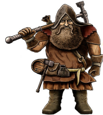
Angela chooses Tigfnar

Gameplay in Novarium is broken into seasons. During each season, you will be in control of one of your characters. While this character goes out into the world, the other characters stay behind to tend to your property or perform tasks like studying or recovering from an injury.