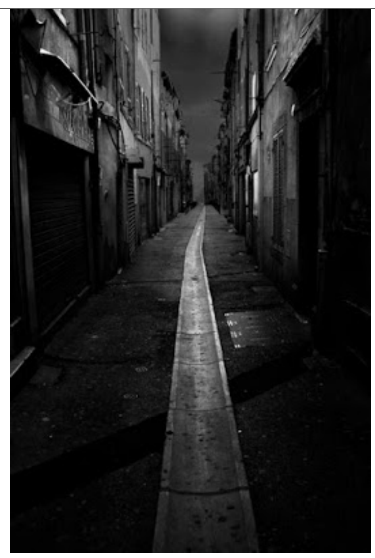
Watch your step...