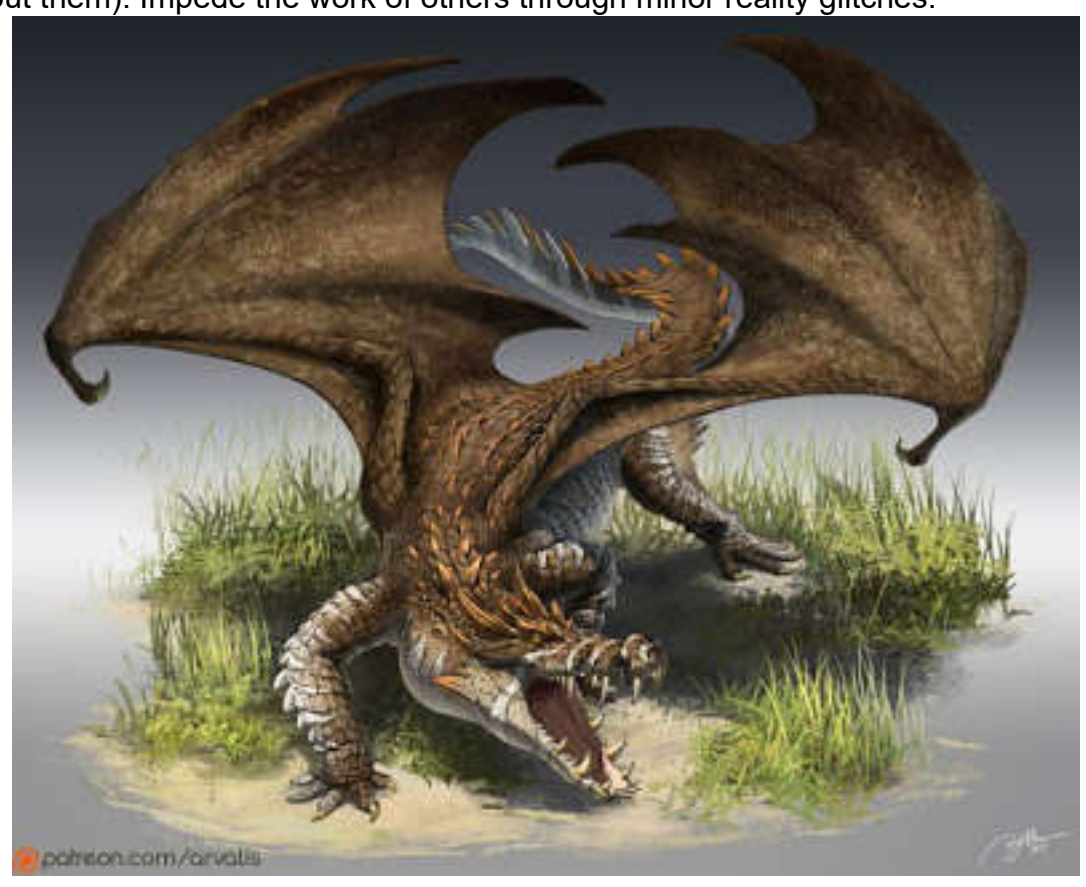
Sewer Dragon improved by a few more cycles of its urban legend.

(everyone but them). Impede the work of others through minor reality glitches.