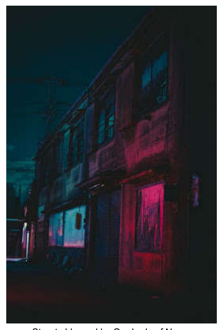
Streets blessed by Our Lady of Neon.

This is the first completed part of a mini-setting I've created, based on the weird city my imagination goes to when I listen to Tom Waits music. This isn't the entire city, it's a neighborhood in it called Noir Weights. Here is one of the notable places in Noir Weights, Mister Waylon's house. The next place I will create is 'The Old Gug Bourbon Distillery'.