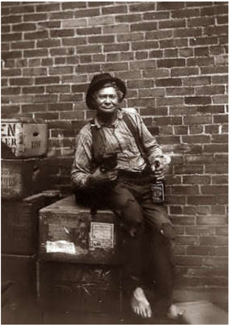
Boozer / Hooch-Head

Motivations / Tactics: Breathe forth acid and disease. Eat someone alive. Drag carcass back to lair.