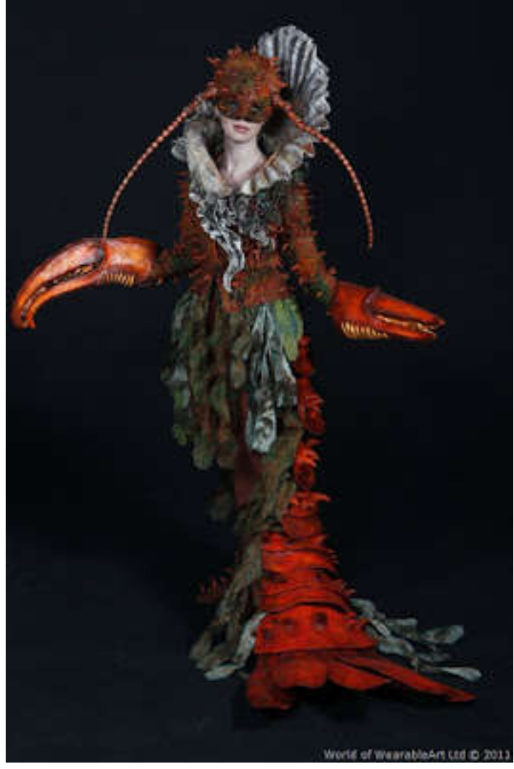
Crusty / Crust Punk