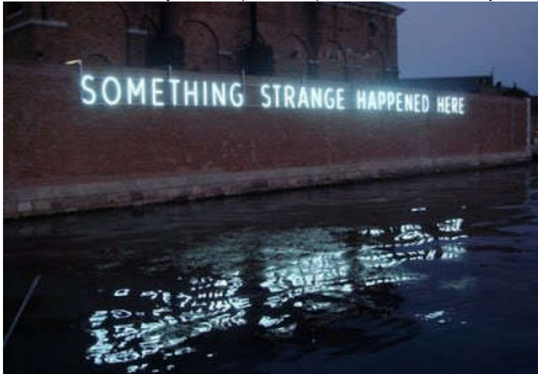
The motto of Noir Weights.

alleyways and sidewalks until neon jaws swoop down to put an end to their misery.