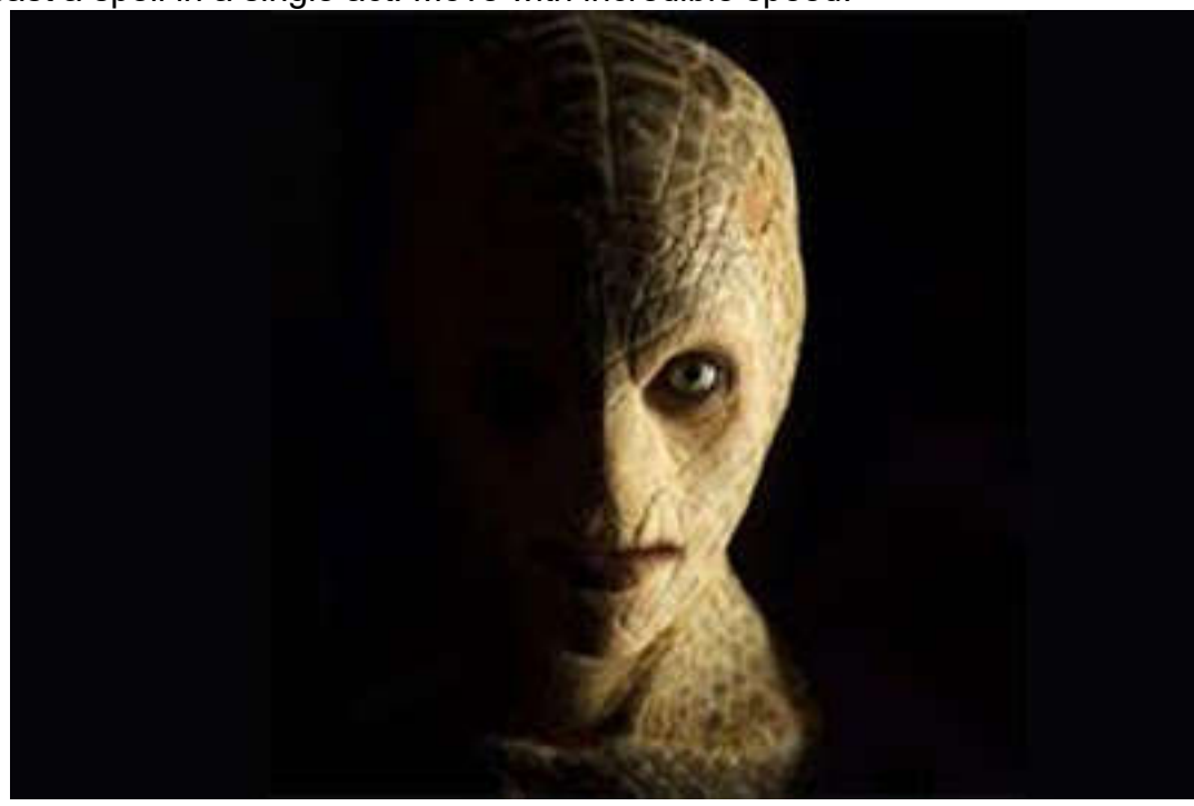
Snake-Boy / Snake-Girl

attack and cast a spell in a single act. Move with incredible speed.