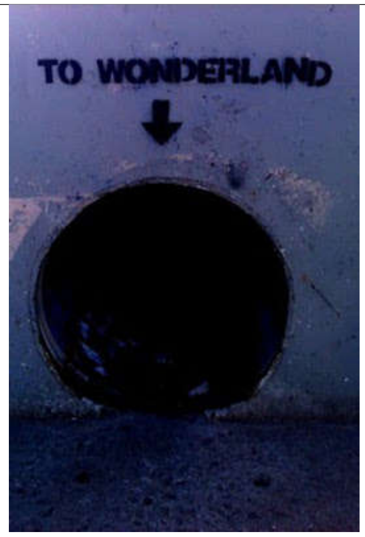
This is just the beginning...