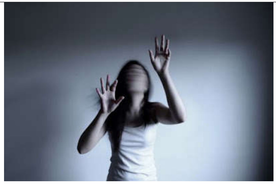
Sugar-Junky / Candied Killer