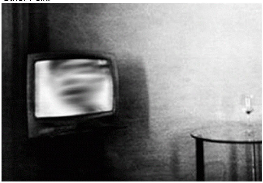
Sit back, relax, and let go...