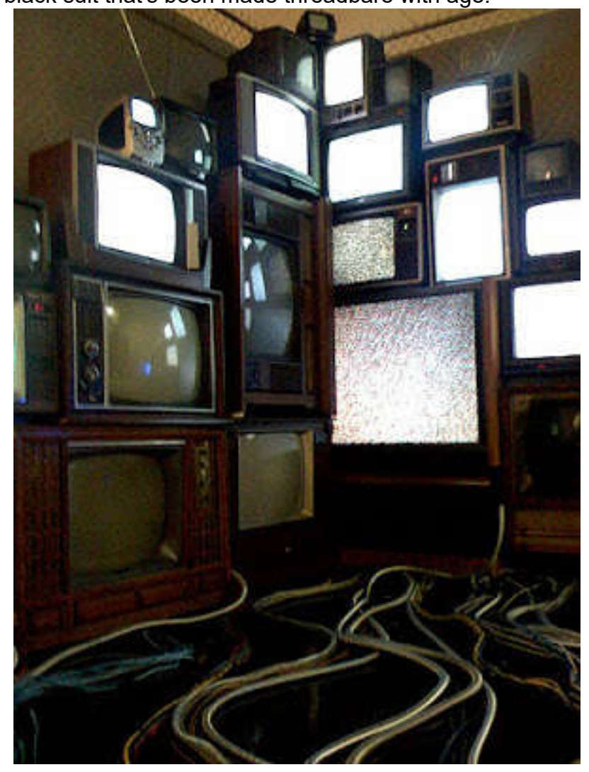
A new addition to the Alter.

o'clock shadow. The man's eyes are sunken and the same no-color as the house. He's always dressed in a tailored black suit that's been made threadbare with age.