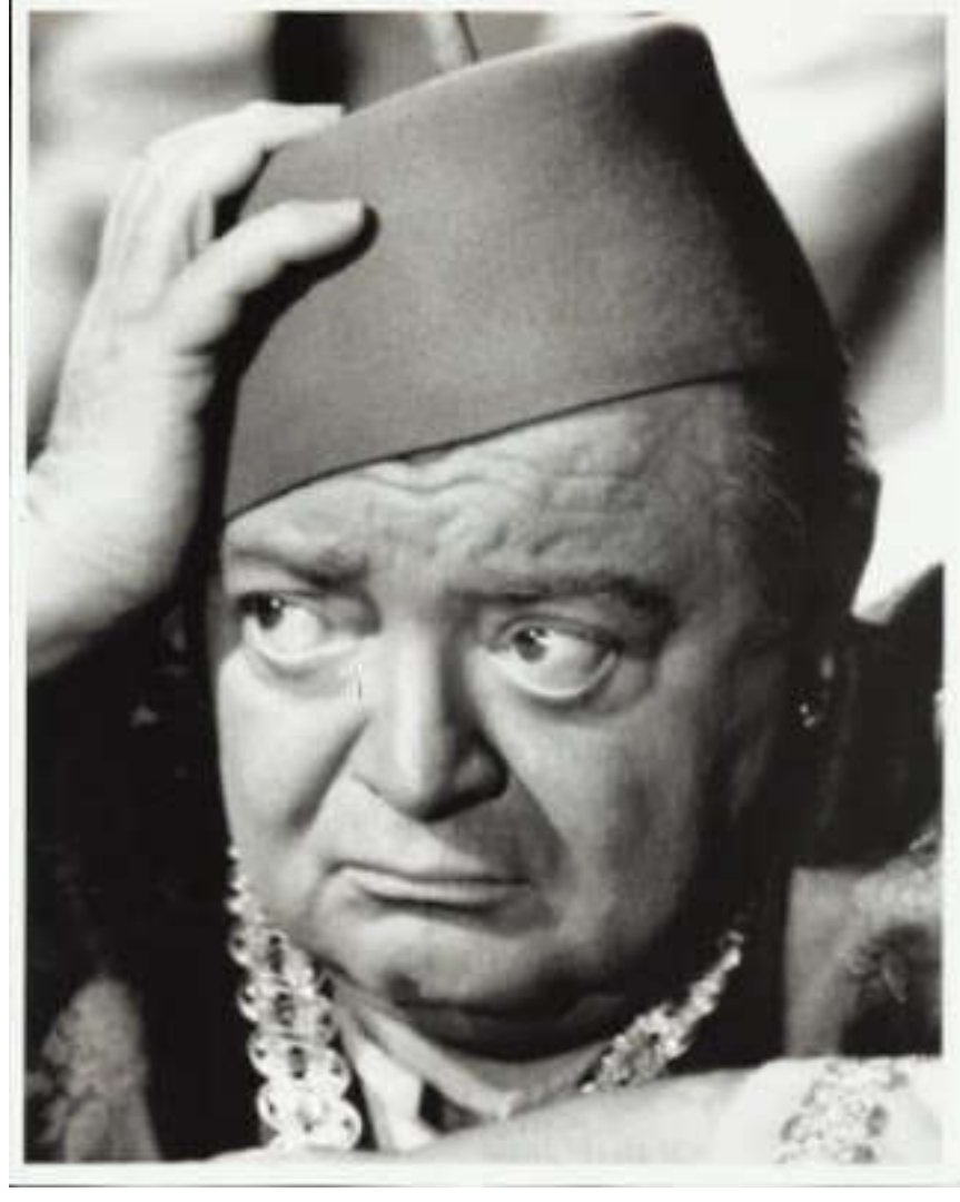
Disty / Fume-Head