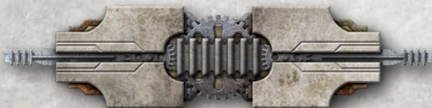
TABLE 14—LOCATION & ATMOSPHERE

If you would like something a little bit zany and different, then just allow the dice rolls to flow naturally without repudiating any rolls or weighing options. Follow the entire process through from start to finish and only pause at the end to reflect upon the dice results; you may just find that you end up with a bizarre outcome that actually works, or, at the very least, provides you some inspiration to make the elements work and seem plausible. Enjoy!