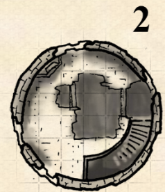
Upper Floor (partly collapsed)