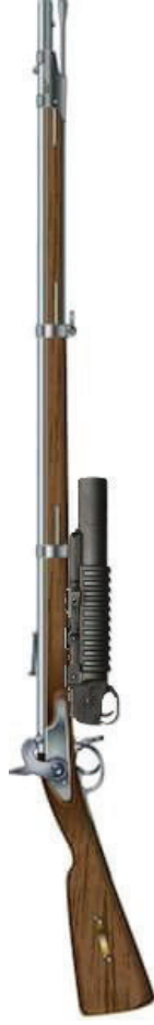
Musket with Underslung Grenade Launcher. A bargain at 100sp!