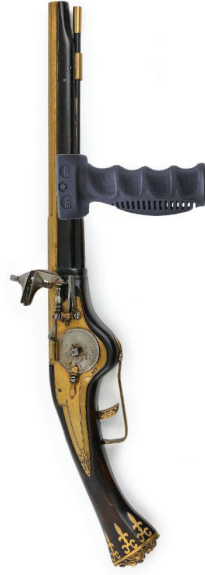
Wheellock Pistol with Tactical Foregrip. At only 32sp each I am practically giving these away!!