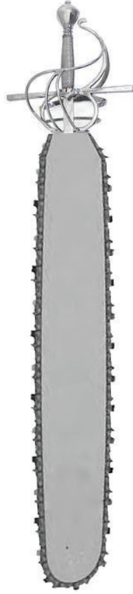
Chainsaw Rapier. Impress your friends for only 25sp!