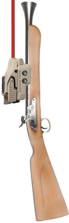
Blunderbuss with Laser Sight. Only 85sp! What value!