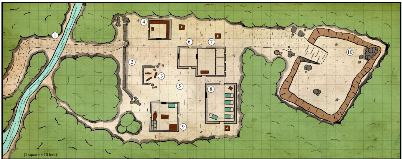
Map 1: The Fort of the Lost Regiment and surroundings