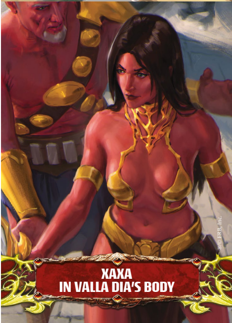
XAXA IN VALLA DIA'S BODY