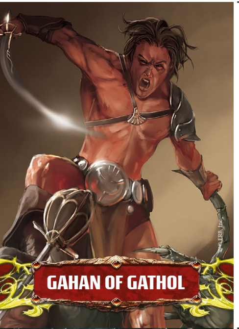
GAHAN OF GATHOL