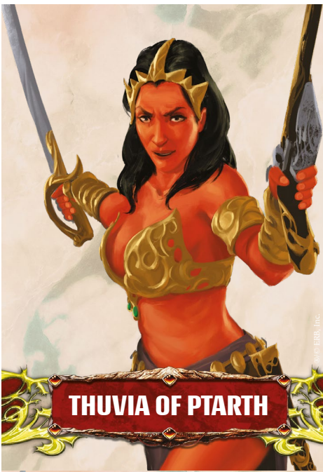
THUVIA OF PTARTH