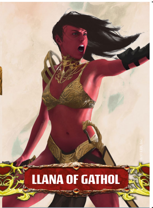
LLANA OF GATHOL