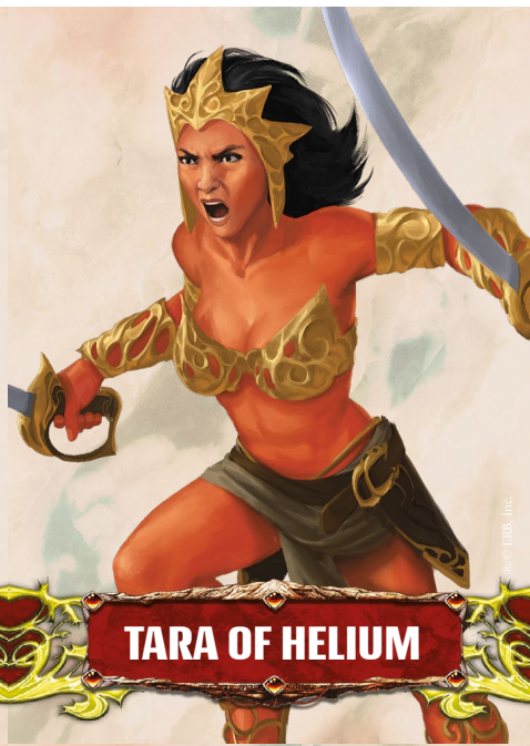
TARA OF HELIUM