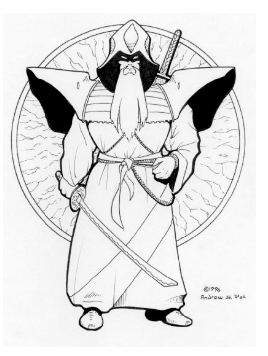
After the fall of the T'Chaing Empire, the emperor's enforcers, with their exotic combat training, were often the only law available in the badlands.

Also listed in this section are some skills that are not necessarily Chi based but are also related to intense training and mental focus. Whether or not they are allowed is up to the GM.