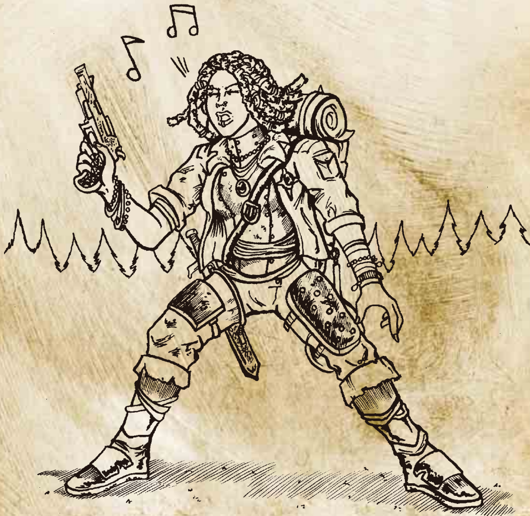
Evangeline Toras -

If Evangeline Toras makes it back to Cygnar she will compose a song about the party's exploits. Within one year the song will be well known and the adventurers all gain a +2 circumstance bonus to Diplomacy checks whilst in any major city within Corvis.