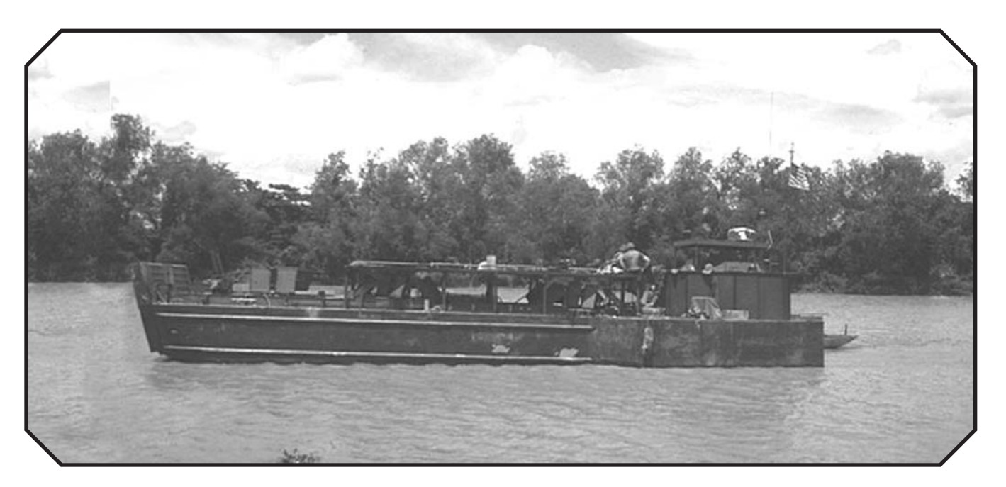
SPECIAL WARFARE, SPECIAL WEAPONS

The MK 7 MOD 6 is made of non-magnetic plastic materials and can dive up to 200'. It has a 1.4-kW electric engine powered by six silver-zinc batteries.