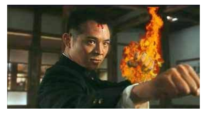
Studio187: Fists of Fusion

This is a totally optional addition to Fists of Fuzion . It does add a gun-slinging attribute to the game. Initiative, Action Value and Evasion bonuses are all quite common. As for Advanced Modifiers you could add the following modifiers: Aerial, Area, Damage, Disarm, Draw, Feint, Follow, Ground, Grounding, Grounded, Multiple, Off-Hand, Rear, Stance, Vital (Stunning Weapons) and Weapon / Power (required).