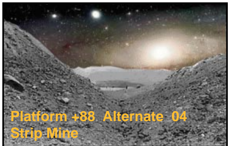
Platform +88 Alternate 04 Strip Mine

Serene world of ponds, small animals and an amazing sky with 5 moons.