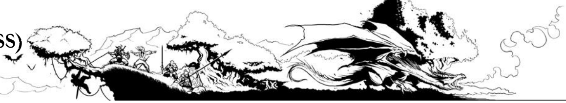
Table X.X: Mystic Scholar