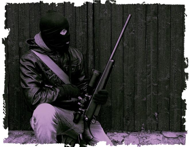
Table 6: The Mercenary

A mercenary gets two extra items in character creation, which must be taken from the Melee Weapons, Ranged Weapons or Armour lists.