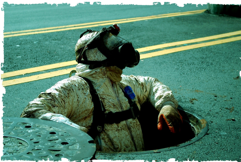
Table 5: The Explorer

Explorers, unlike other members of the occult underground, lack familiarity with weapons. Weapons wielded by an explorer do a dice size of damage less. (for example, a shotgun normally does d10 damage, but in the hands of an explorer only does d8).