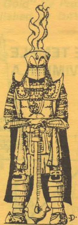
PRIEST of Lord Vimuhla