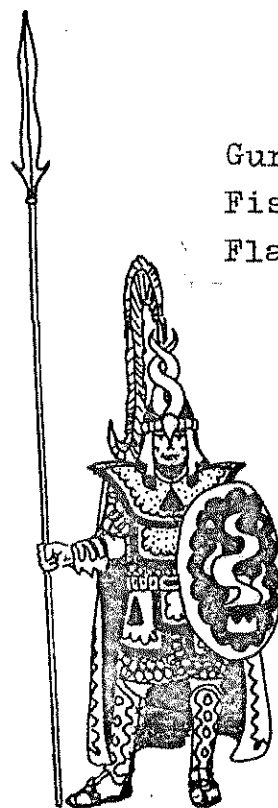
Gurek of the Fishers of the Flame (Vridu)