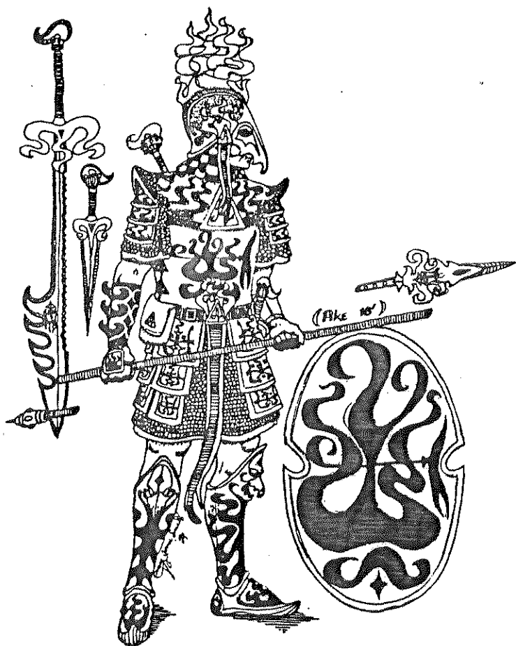
pikeman of the Legion of Searing Flame 10th Imperial Heavy Infantry