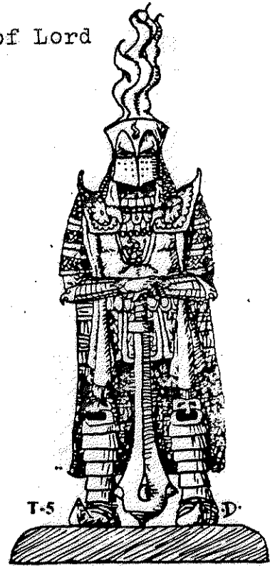
Priest of Lord Vimuhla