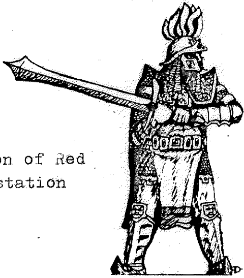
Legion of Red Devastation