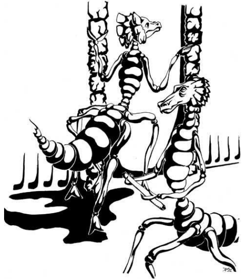
“Two Pé Chói exploring a passage in the Underworld beneath Takálla. One holds a scroll ready, in case a spell is needed against some surprise attack.”