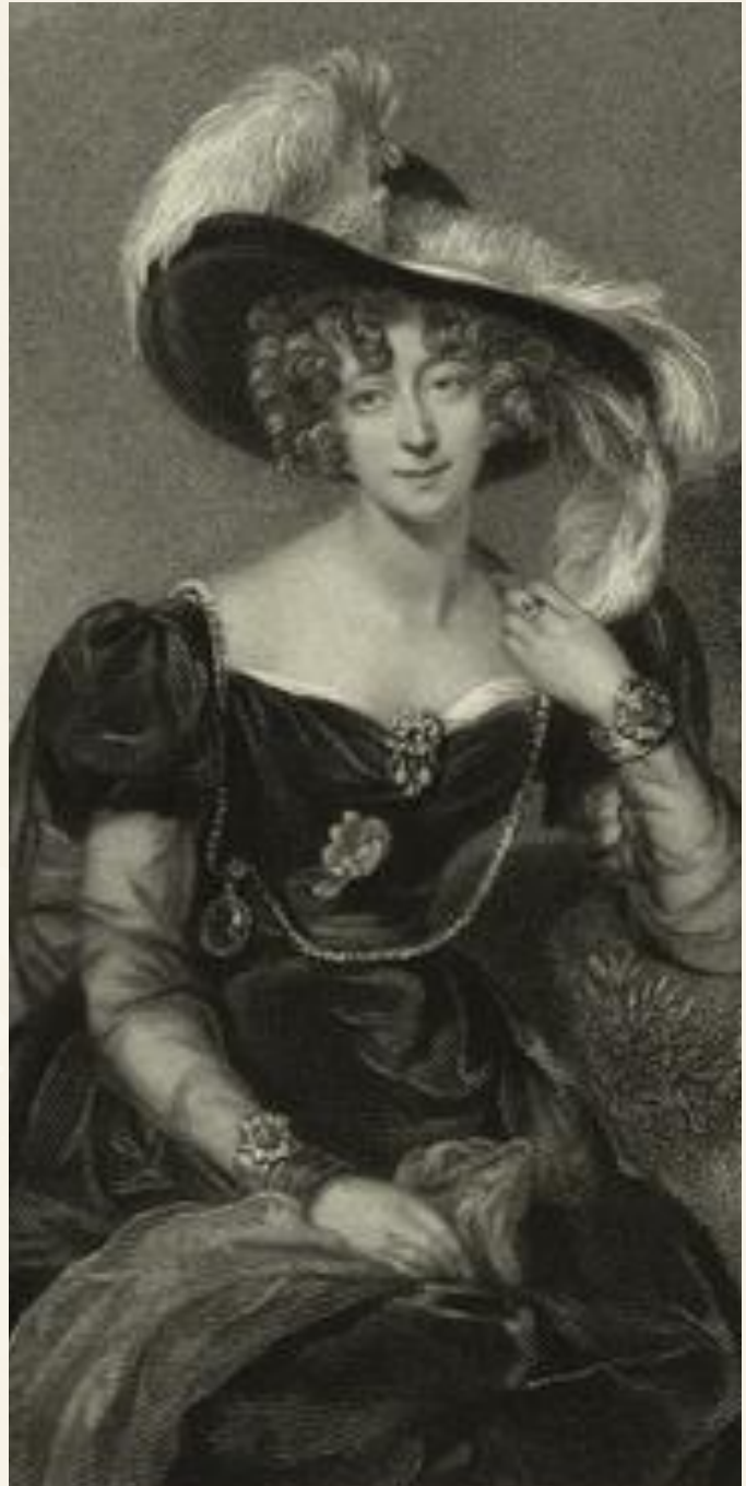
A portrait of Laeral Silverhand when she was Lady Mage of Waterdeep and resided at Blackstaff Tower.

It was also a time when she found herself (much to her surprise, I imagine) as being seen as a trendsetter in fashion. For a woman, who admittedly, was always more comfortable wearing the doeskin leggings and forester's attire of an adventurer in the North, it was quite a change.