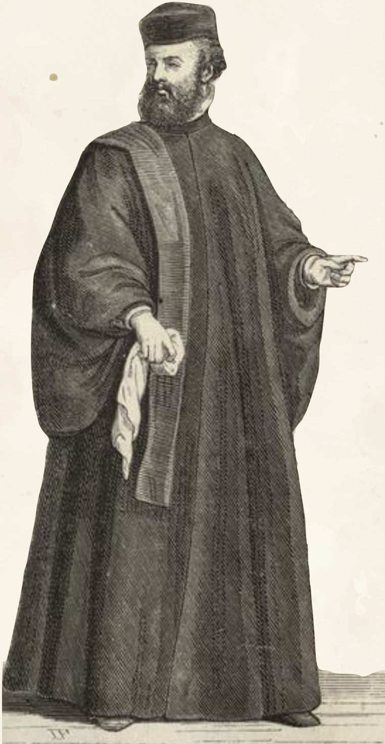
Khelben Arunson, when he was master of Blackstaff Tower.

Laeral's Siphon: Wearing the anklets can dampen spellcasting abilities by emanating a weak antimagic field. While worn the anklet requires the caster to make a DC 15 Constitution check before attempting to cast a spell. Failure causes the magic to dissipate, expending the spell slot or extinguishing the magic writing on a scroll.