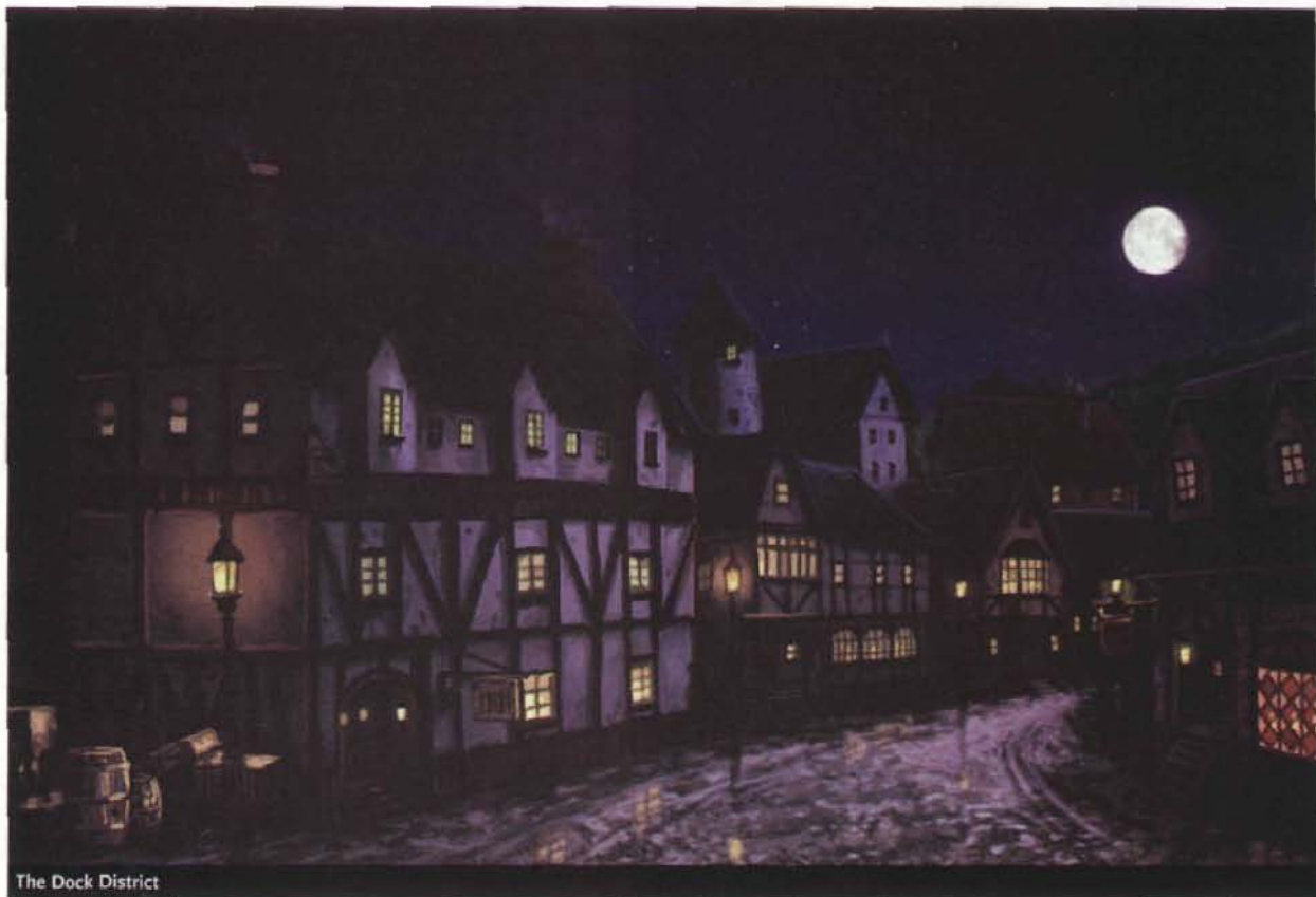
The Dock District

traders to settle in Hardby and give the local merchants an edge over outsiders. Roban is an agent of the Slavelords and a priestess of the Earth Dragon (LE demigod of earth, weather, and hidden treasures; Domains : earth, evil). In 592 cy, she married one of the merchants on the Trade Council, giving her access to and influence over Council business. Roban uses her expeditions to dispose of troublesome adventurers who become too interested in the Slavelords, sending them into the wilds and arranging for bandits or humanoids to ensure they do not return. Roban has contacts with Aleeta Norbelos, and is quietly supporting the young gynarch's bid for the Throne of Wood .