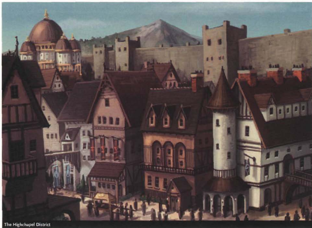
The Highchapel District

sters is one thing. Bringing them (and oneself) back alive is another.