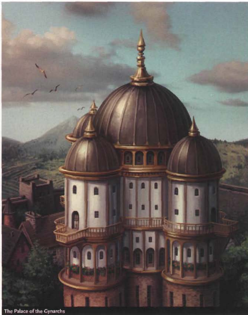
The Palace of the Cynarchs

owners who, without exception, have suffered a catalogue of misfortunes. While most have quickly sold up and moved on, a few have tried to tough out their bad luck only to go insane, raving about being haunted by a ghostly figure in smoldering robes.