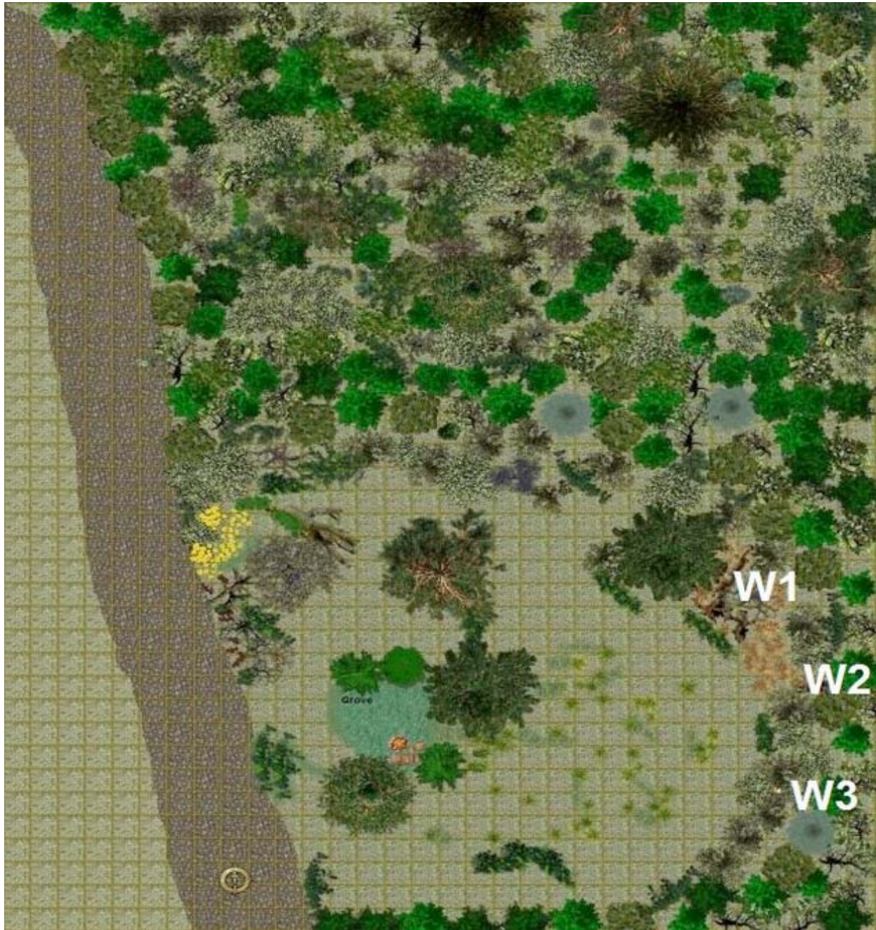
A Meal Interrupted