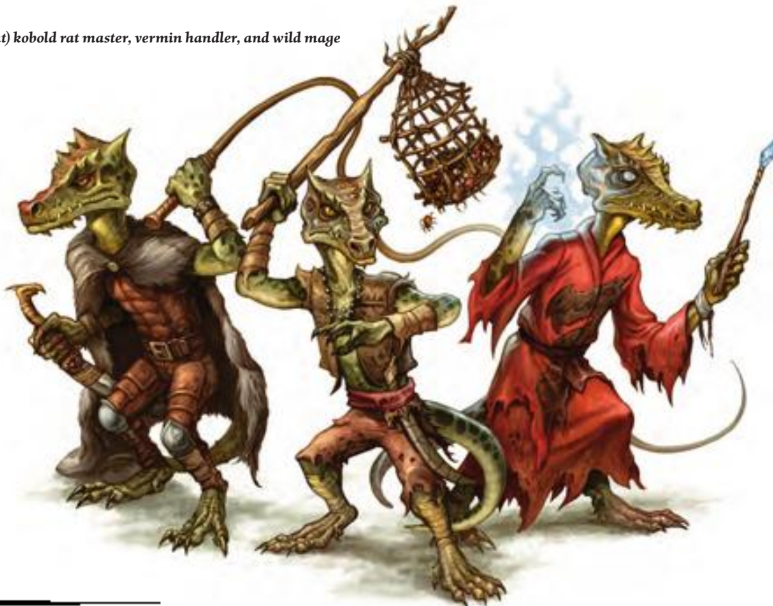
(Left to right) kobold rat master, vermin handler, and wild mage

In battle, wild mages surge with arcane power. It rumbles just beneath their skin, and sometimes manifests as belches of fire from their mouths, miniature lightning strokes from their eyes, or a patina of frost beneath their feet. They are jumpy, easily startled, and prone to stuttering, mild seizures, and random muscle spasms.