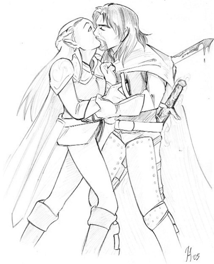
What dramatic twists lay ahead for the heroes of Gate Pass?

Material Component: Ten gold coins which have sat in a fire for at least one hour.