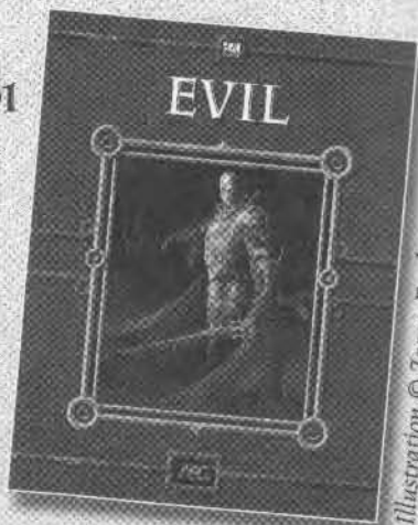
Illustration © Jason Engle

Who said you had to play the good guys? Being evil just got easier. This d20 system sourcebook has everything you need to run evil characters, develop evil campaigns, and make your nasty NPCs just a little bit nastier. Evil has rules for new prestige classes, new spells, new clerical domains, and demon summoning. If you're playing good after this book is out, you're on the wrong side of the game. 128 Pages, soft cover.