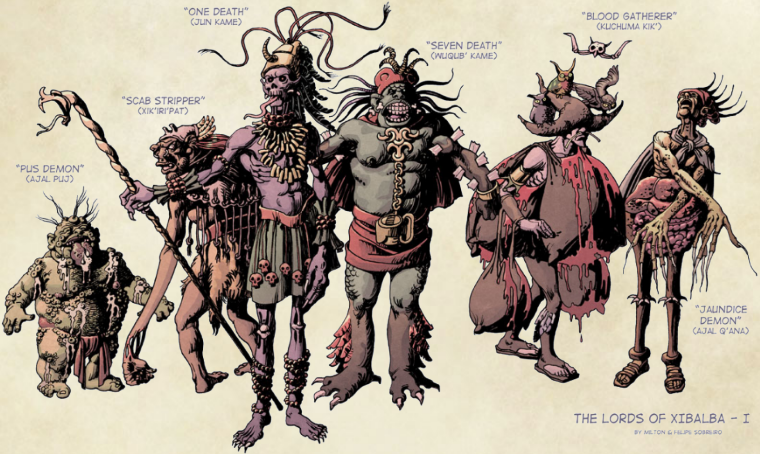
"JALINDICE DEMON" (AJAL Q'ANA)