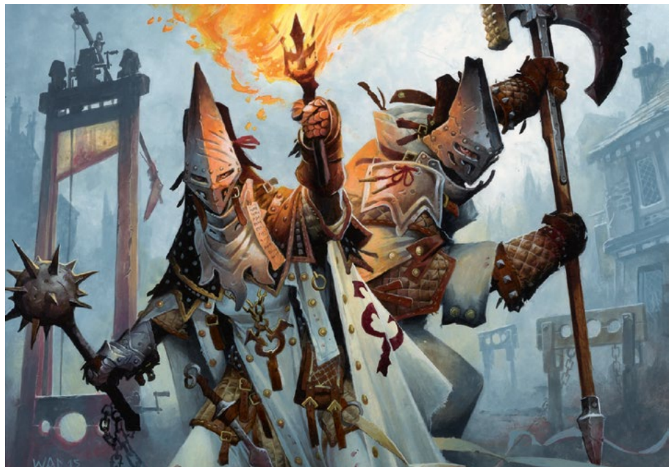
Lunarch Inquisitors

In this town on the shores of Maurer Lake, the Lunarch Inquisition has taken fierce hold. A half-crazed inquisitor named Seeta has come from Thraben to the remote reaches of Stensia to root out evil and cultivate the happiness that should come from faithful devotion to Avacyn. A small demon cult does hide in the shadows of the town, led by Lady Fiona Wachter. No one in the village harbors any notion of escaping Innistrad, but they are desperate to stave off the anger of the angels.