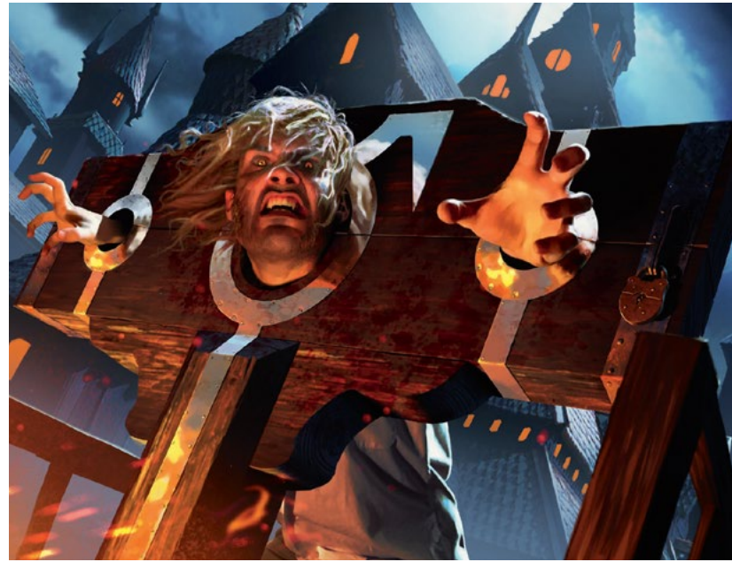
Bound by Moonsilver by Joseph Meehan

Spear (Human Form Only). Melee or Ranged Weapon Attack: +4 to hit, reach 5 ft. or range 20/60 ft., one target. Hit: 5 (1d6 + 2) piercing damage, or 6 (1d8 + 2) piercing damage if used with two hands to make a melee attack.