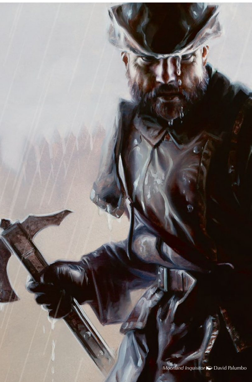
Moorland Inquisitor by David Palumbo

Equipment: A holy symbol, a set of traveler's clothes, and a belt pouch containing 15 gp