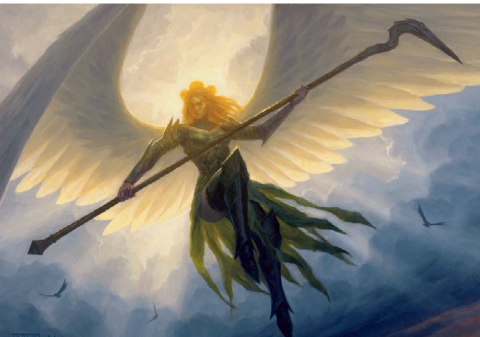
Sigarda, Host of Herons

The dragon that appears if characters fail to correctly open the door to Karolus's tower is a balefire dragon, but with the statistics of a young blue dragon .