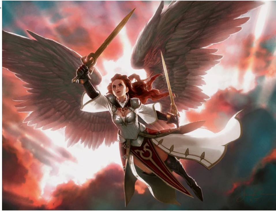
Gisela, Blade of Goldnight ▶ Jason Chan

Flight Goldnight was an army of soldier-angels focused on the martial strength of the church. These angels were characterized by pragmatism and strict observance of church law. They were strategists in battle and skillful leaders during armed conflicts, cultivating a martial mindset that made them more than willing to take up arms when the need arose. The leader of Flight Goldnight was Gisela, called the Blade of Goldnight or the Blade of the Church.