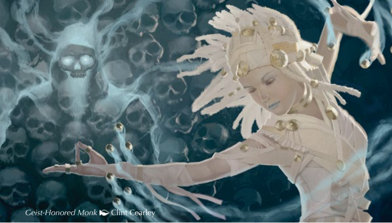
Geist-Honored Monk © Clint Cearley