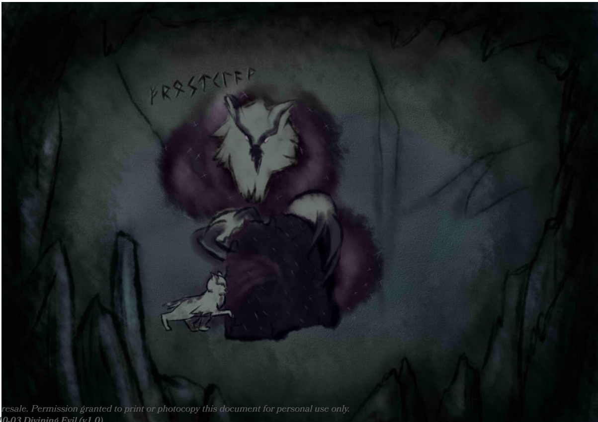
FIGURE 2: SOUTH WALL