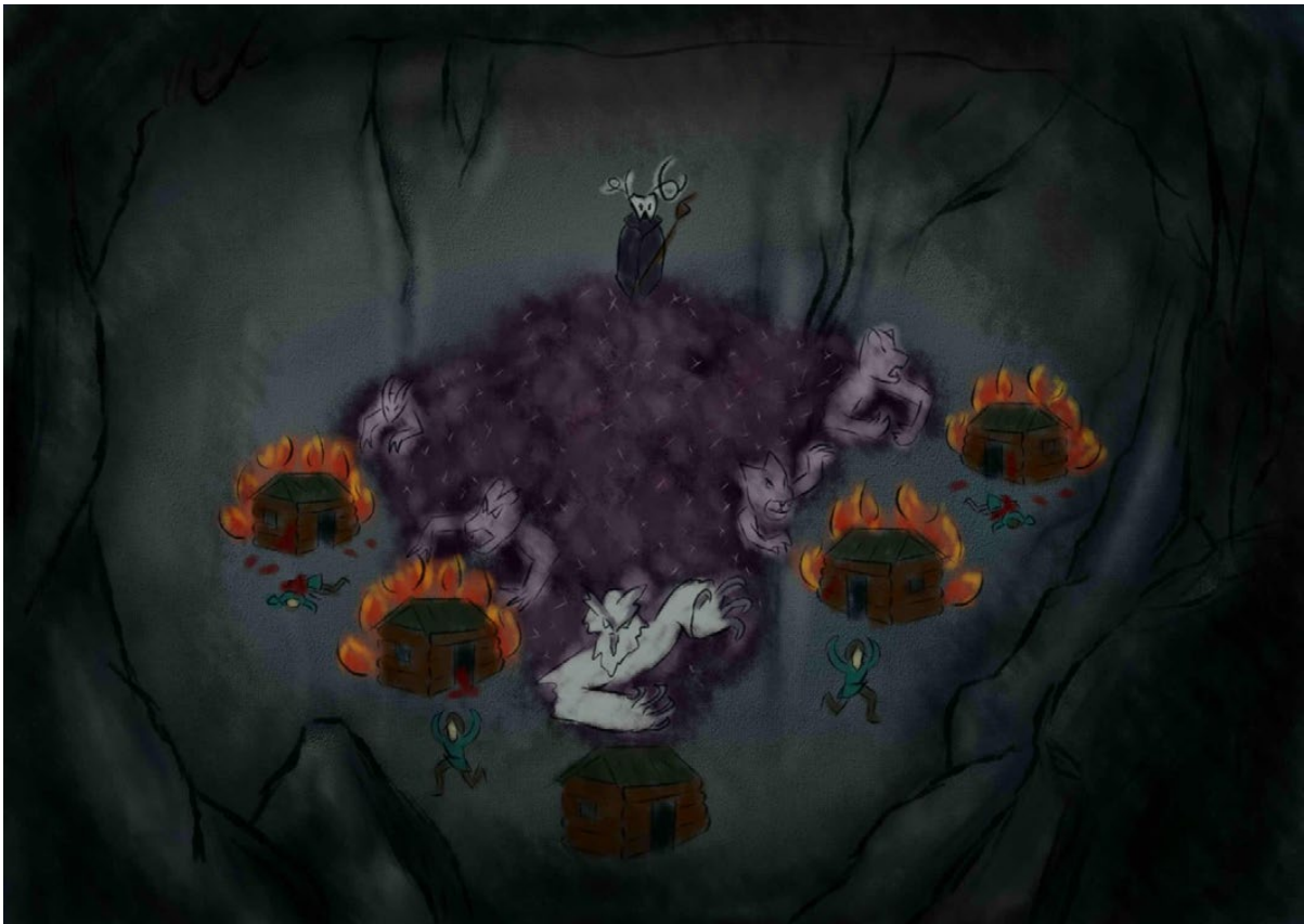
FIGURE 4: WEST WALL