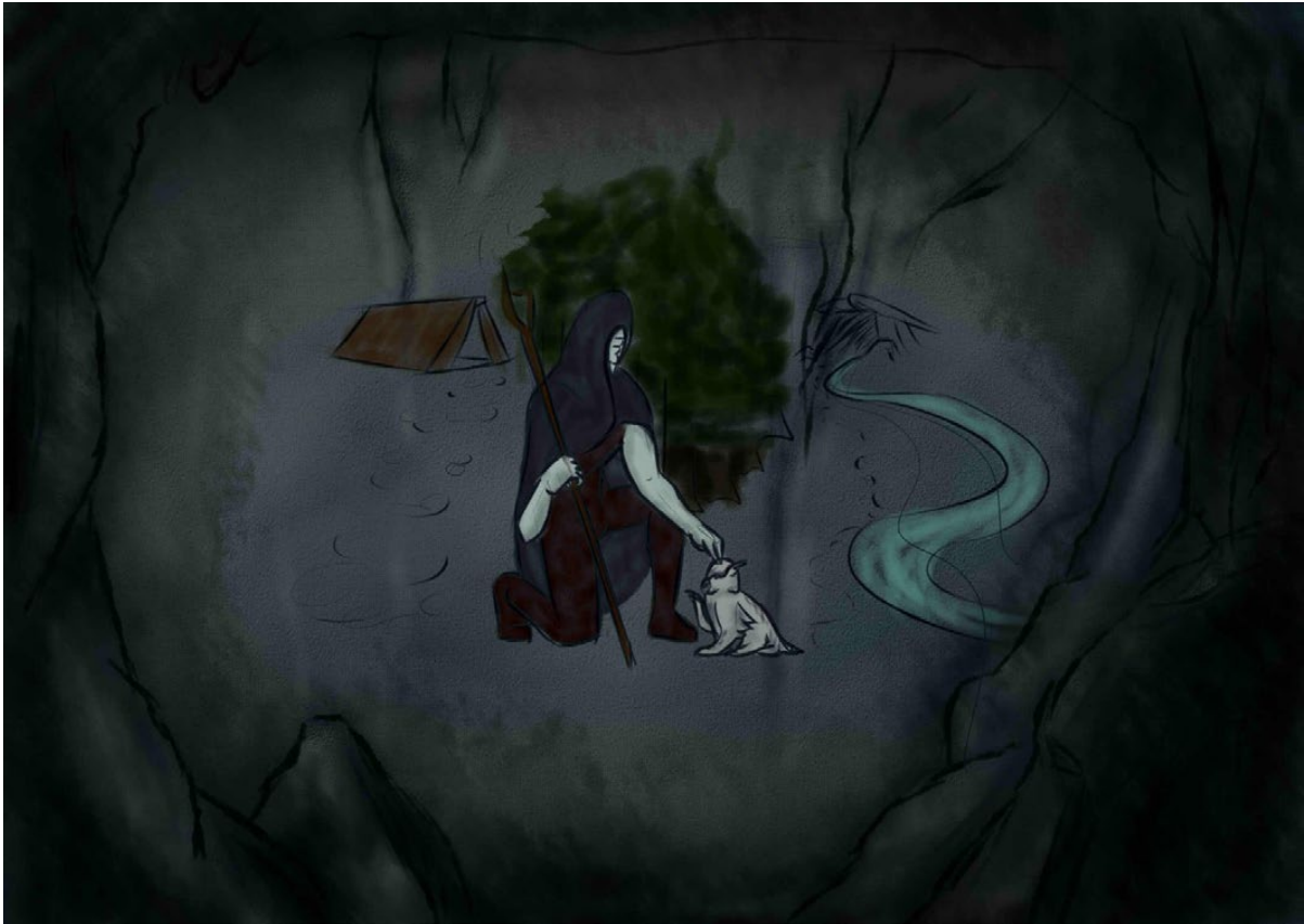
FIGURE 1: NORTH WALL