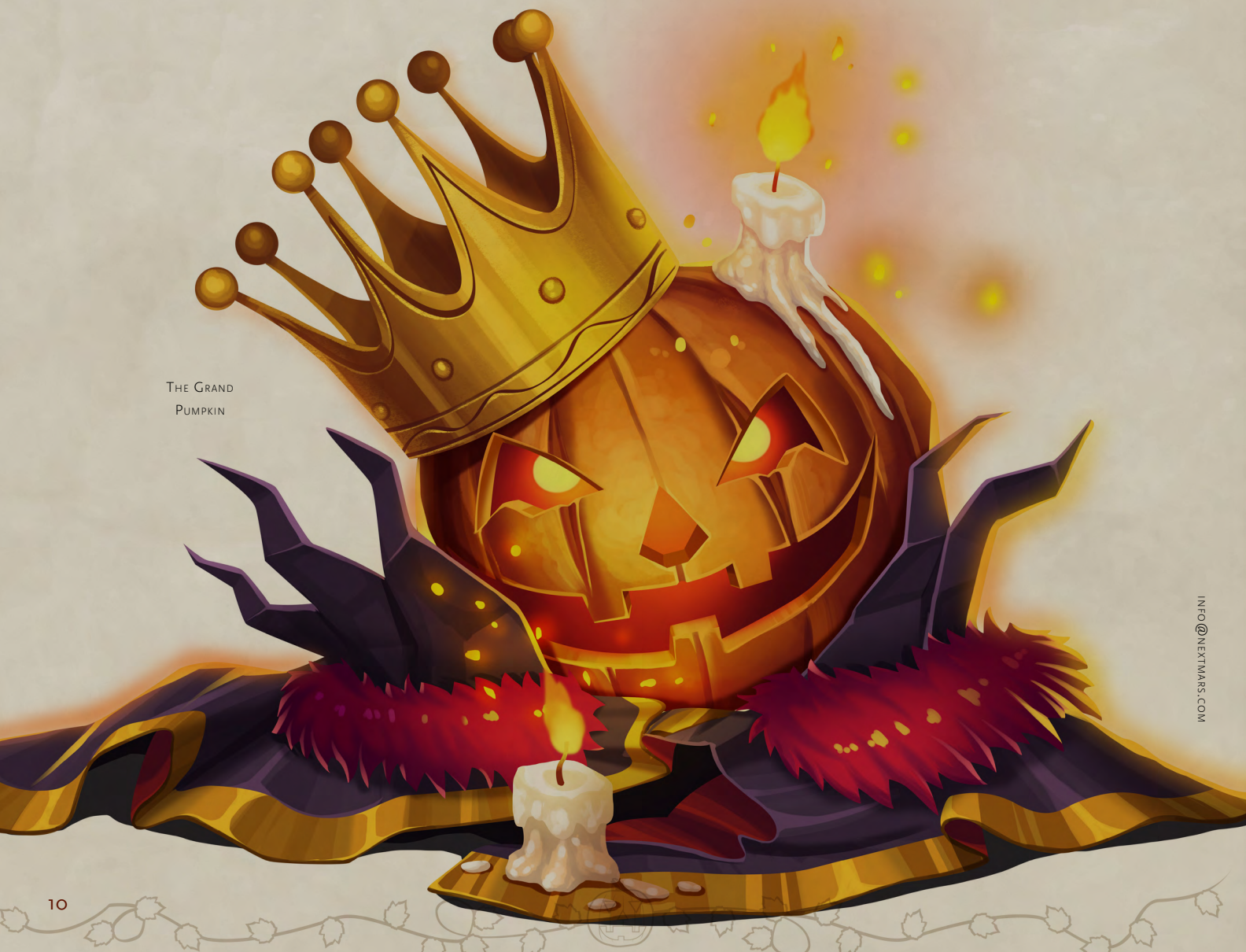
THE GRAND PUMPKIN

Though they are fully formed and the label is not technically accurate, squashlings that are first raised by magic are called "sprouts," owing to their lack of worldly knowledge and lessened control of their bodies. Still, a sprout's mind has the same ability to grasp concepts and complex thoughts as an adult human. Sprouts may be naive, but they learn quickly, and usually have a functioning grasp of how the world works within a week or two.