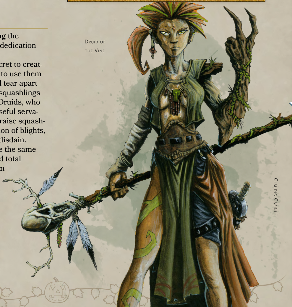
DRUID OF THE VINE

Quarterstaff. Melee Weapon Attack: +4 to hit (+6 to hit with shillelagh ), reach 5 ft., one target. Hit: 4 (1d6 + 1) bludgeoning damage, or 7 (1d8 + 3) bludgeoning damage with shillelagh or if wielded with two hands.