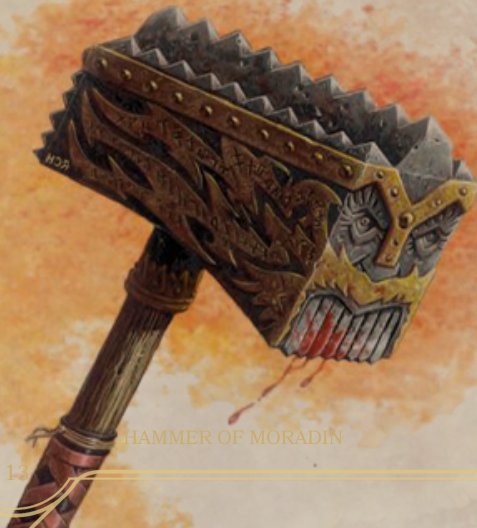
HAMMER OF MORADIN

Starting at 3rd level, your hammer does extra damage and can hit up to two additional targets when thrown. When throwing the hammer, make a single ranged attack roll against up to three targets within a 60 foot cone from your position. Roll damage separately for each creature hit and add your proficiency to the damage. You can use this feature once, and can use it again after finishing a short or long rest.