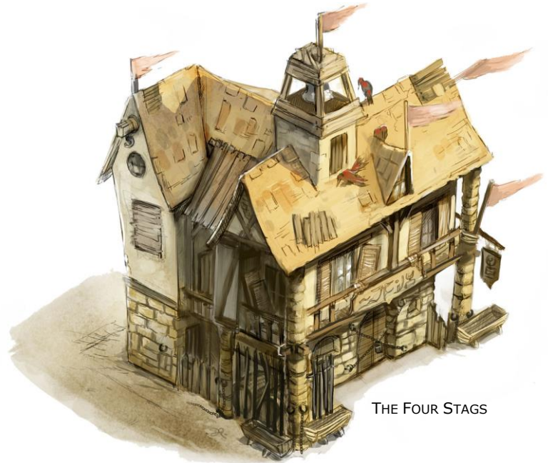
THE FOUR STAGS

where many Owlmen come to trade with way-merchants, hire guards or agents or a night’s companionship, and meet outlanders. { For more, see The Bowshot entry. }