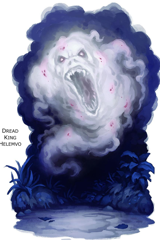
DREAD KING HELEMVO

In life, Helemvo Relurvor was a NE male Damaran human wizard, a small, balding, dour and paranoid man with glittering black eyes. The Spellplague transformed him horribly into a sort of "living spell" undead; he persists as a gray, smokelike mist that can only solidify into hovering human-like form to speak and cast spells for 4d4 minutes a day (and only 2d4 minutes at a time), though he can shape his mist-form sufficiently to form limbs and gesture, all the time.