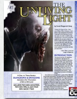
The Unliving Light