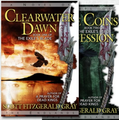
The Exile's Blade