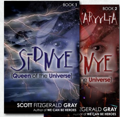
Sidnye (Queen of the Universe)