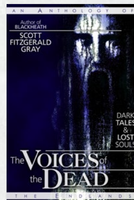
The Voices of the Dead