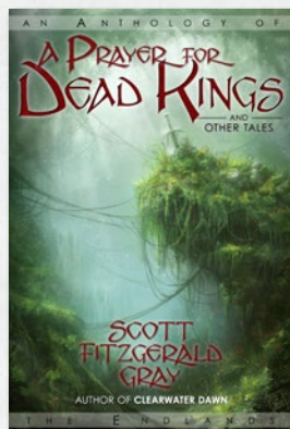
A Prayer for Dead Kings and Other Tales