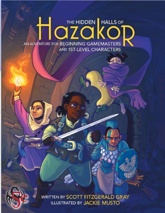
The Hidden Halls of Hazakor