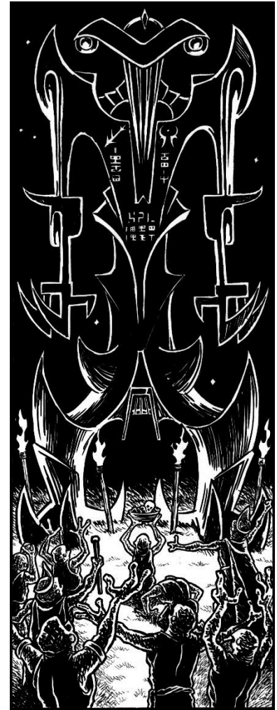
Figure 1 - "Myth God" by Luigi Castellani