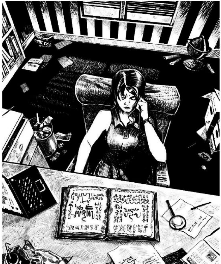
Figure 2- "Scholar" by Nikola Avramovic