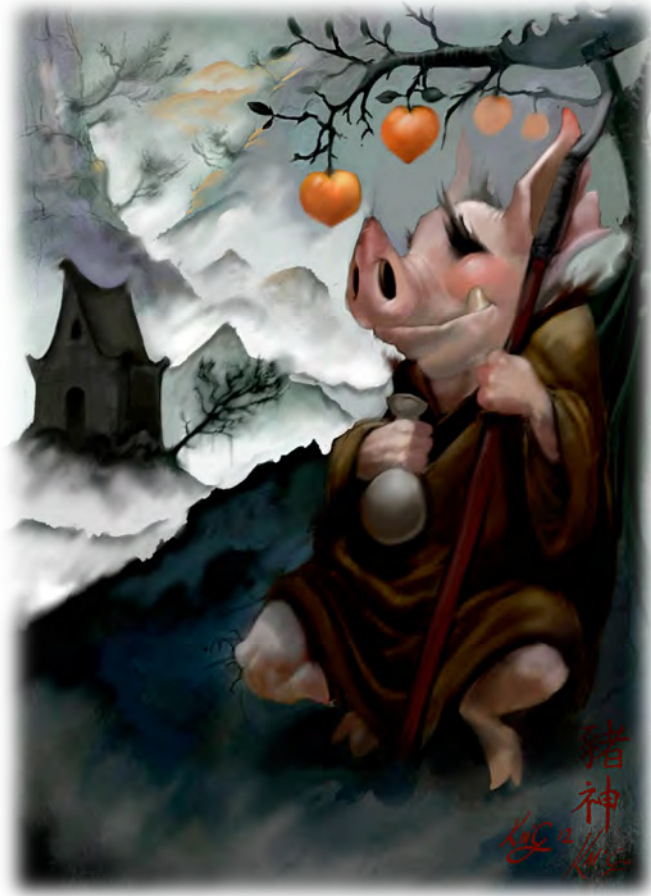
Illustration by Kieron McGuire