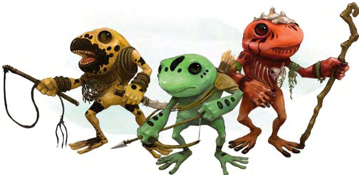
Illustration from Volo's Guide to Monsters