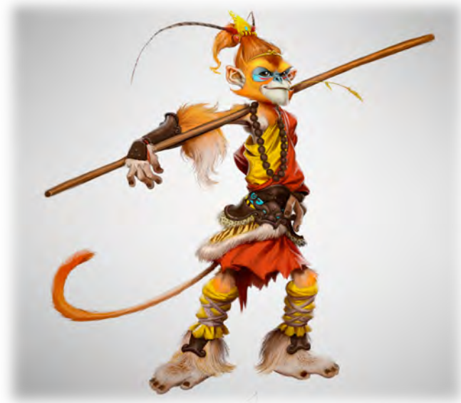
Illustration by Alfonso Pardo Martínez

Woodland Traveler. Difficult terrain due to plants, bushes or trees does not impede your movement.