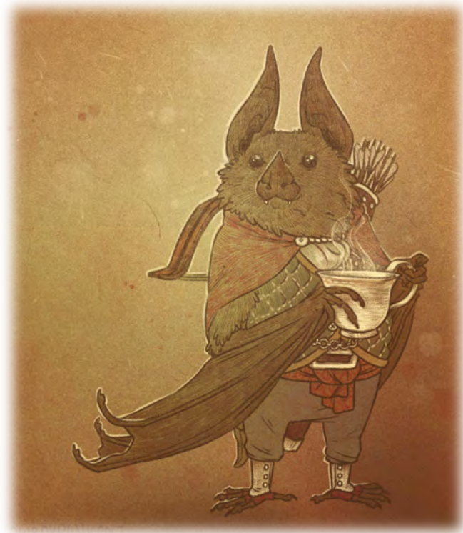
Illustration by Lorne Colt