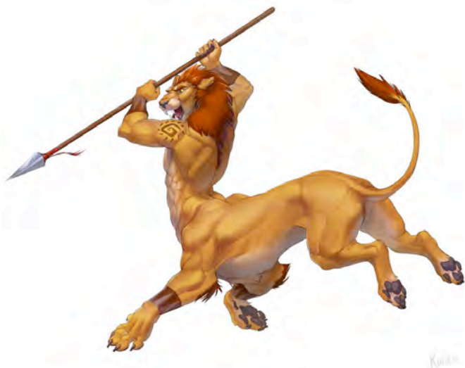
Illustration by Kahito Slydeft