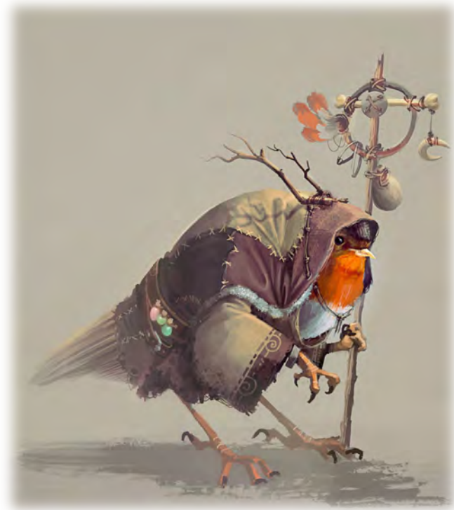
Illustration by Vilko