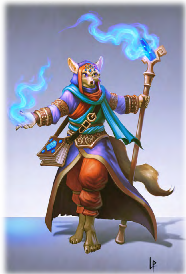
Illustration by Luiz Prado