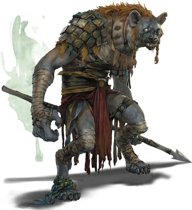
Illustration from the Monster Manual