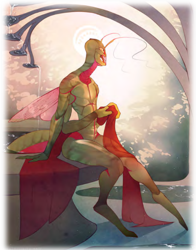
Illustration by Molten Gold Art

Caste System. Zanzaro are bred for particular societal roles from the time they are laid as eggs, and are eventually born into an inescapable caste. Choose one of the following subraces: Royal , Soldier or Worker .