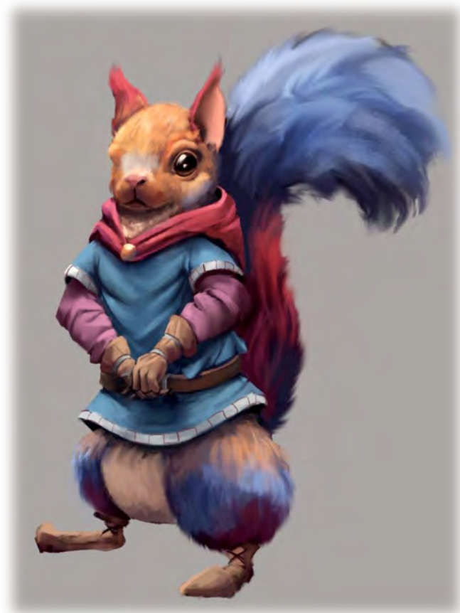
Illustration by Zeker Toons