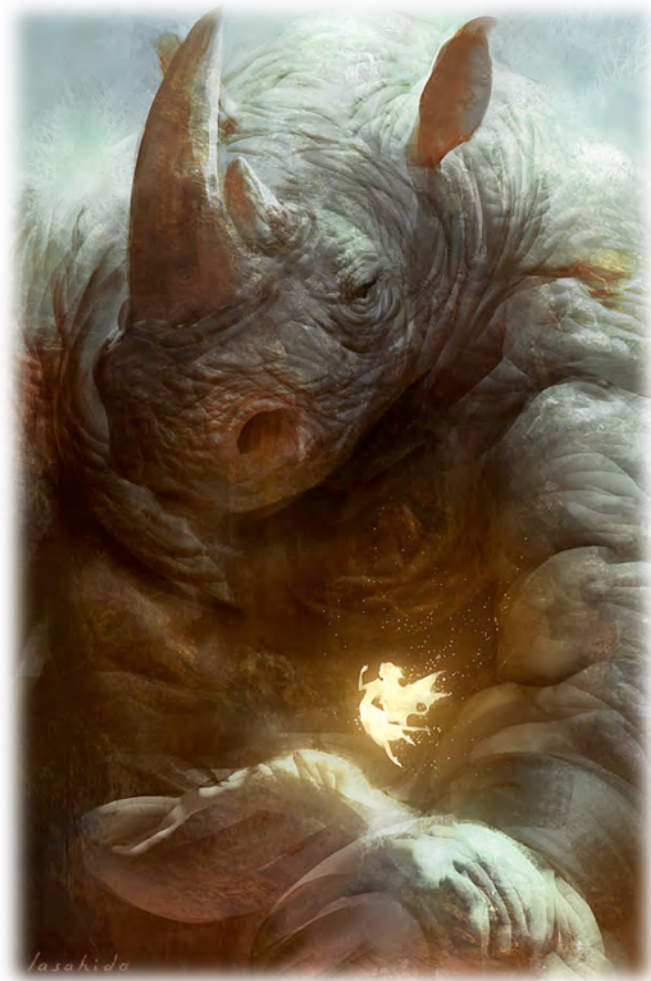
Illustration by Lius Lasahido