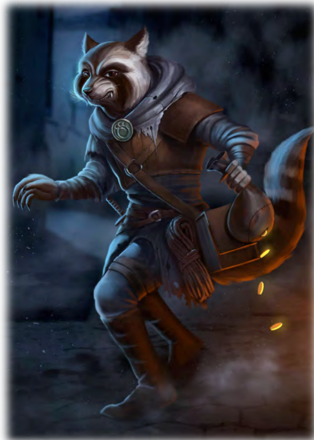
Illustration by Dante2906

Sharp Tongue. You know the vicious mockery cantrip. When you reach 3rd level, you can cast the knock spell once with this trait, and regain the ability to do so when you finish a long rest. Intelligence is your spellcasting ability for these spells.