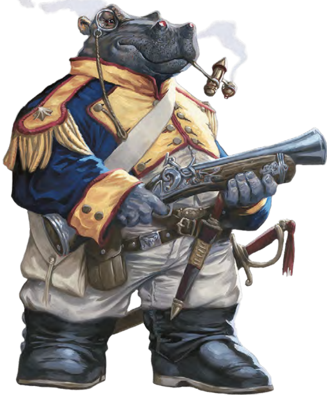
Illustration from Mordenkainen's Tome of Foes