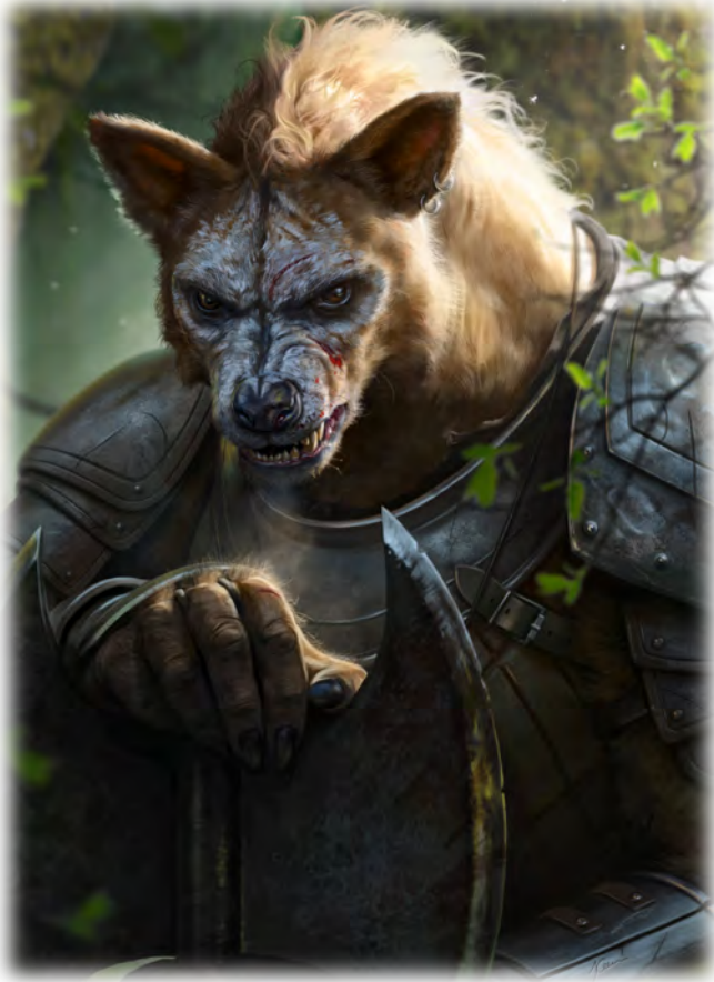
Illustration by Jarrod Owen