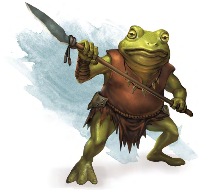
Illustration from the Monster Manual