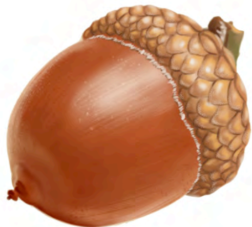
Illustration by Steve Gonzales

Shadowy Legacy. Once you reach 3rd level, you can cast the darkness spell; you must finish a long rest in order to cast the spell again using this trait. When you cast the darkness spell, you are able to see normally inside of it. Once you reach 5th level, you can also cast the locate animals or plants spell; you must finish a long rest in order to cast the spell again using this trait. Wisdom is your spellcasting ability for the spells.