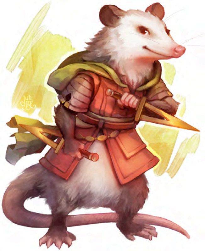
Illustration by Juliane Prenhacca