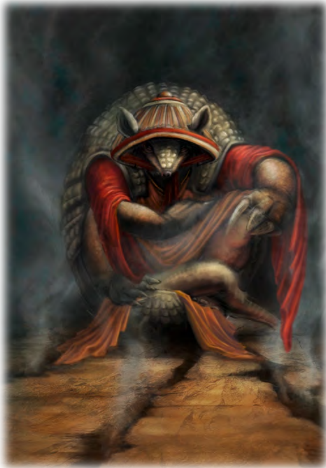
Illustration by Theresa Königseder-Haller