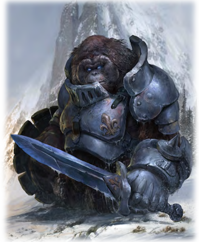
Illustration by Dongjun Lu

Aquatic Mastery. You know the shape water XGE cantrip. Once you reach 3rd level, you can cast the ice knife XGE spell as a 2nd-level spell; you must finish a long rest in order to cast the spell again using this trait. Once you reach 5th level, you can also cast the locate animals or plants spell if you can see a body of water; you must finish a long rest in order to cast the spell again using this trait. Wisdom is your spellcasting ability for these spells.