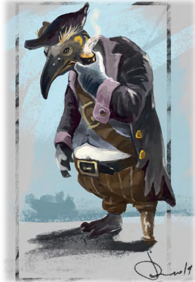
Illustration by Roman Kondratenko

Apelong do not live quite as long as their human cousins, and mature and age at more rapid rates. The greater apes are divided into three distinct races: the ozo , the panzu , and the suxiu . The ozo tend to dedicate themselves to a life of duty and service, while the panzu and suxiu are more likely to take to a life of freewheeling opportunism.