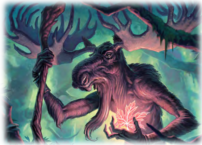
Illustration by Joel Hustak