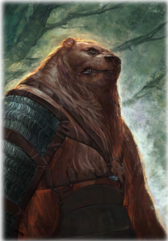
Illustration by Tuncer Eren