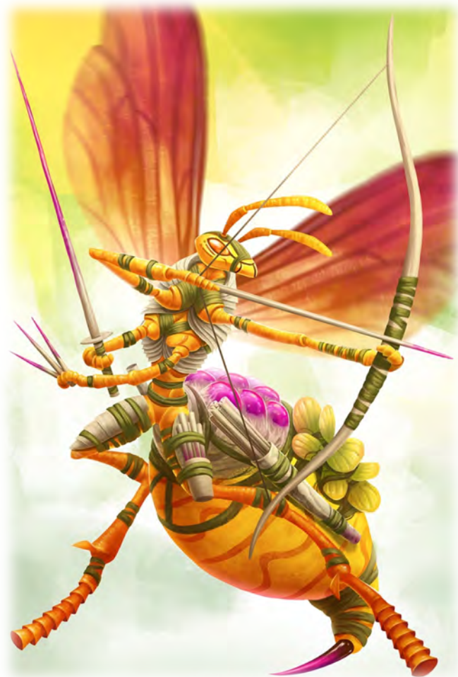
Illustration by Matthieu Pierron

Powerful Build. You count as one size larger when determining your carrying capacity and the weight you can push, drag, or lift.