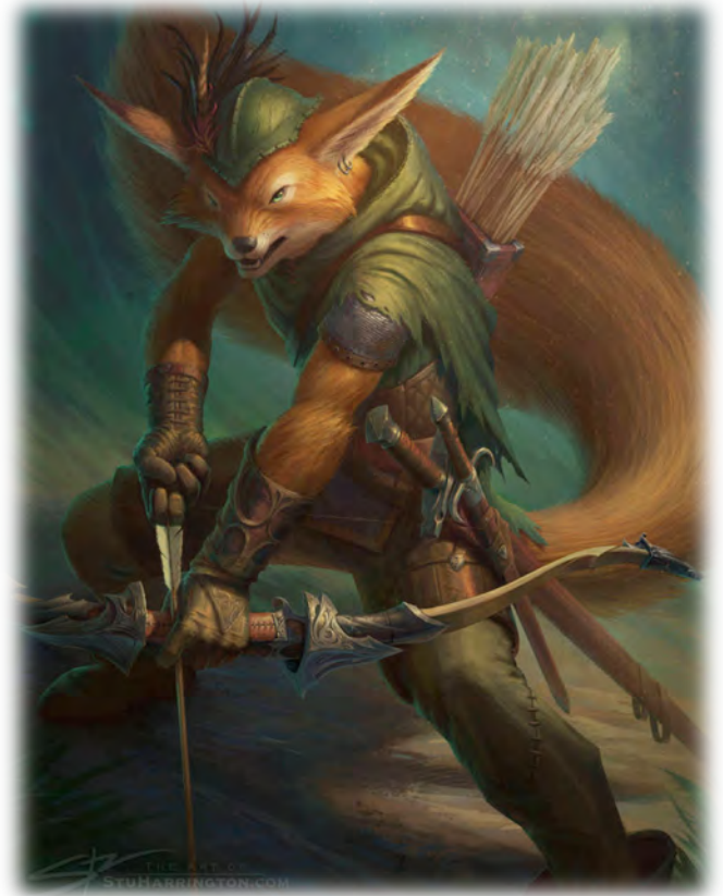
Illustration by Stu Harrington

Subrace. Choose one of the following subraces: Raposi , Tenko or Guaxin .