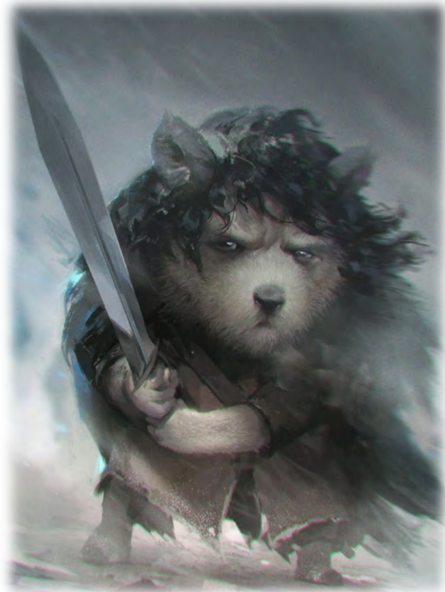
Illustration by Viktor Titov