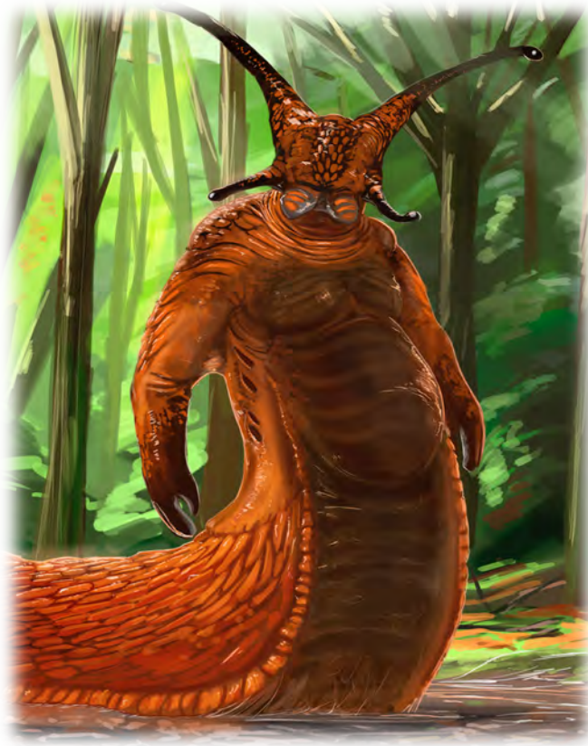
Illustration by Theme Finland