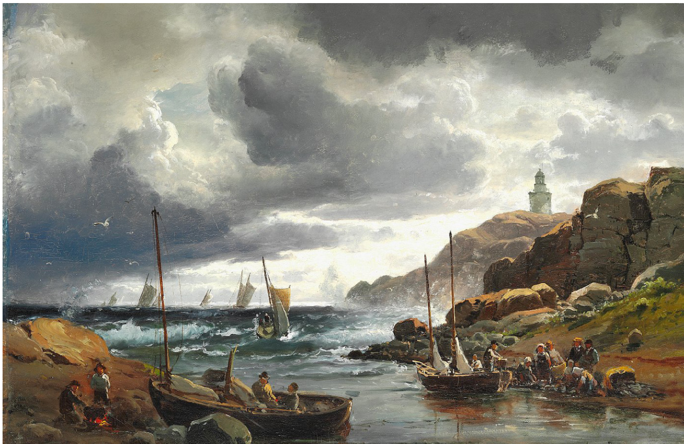
Refugees flee the encroaching fog that now surrounds Stonewatch Lighthouse