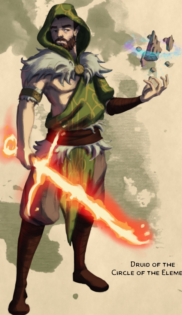
DRUID OF THE CIRCLE OF THE ELEMENTS