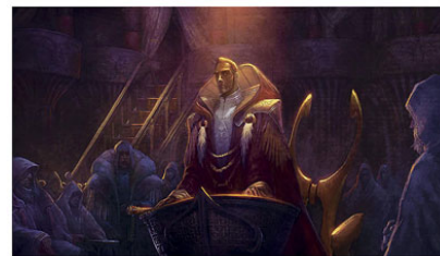
The Tribunal of Thronehold