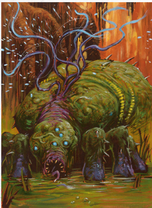
“SPARK LASHER” from the DMs Guild Creator Resource