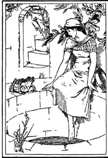
THE WELL OF THE WORLD'S END.