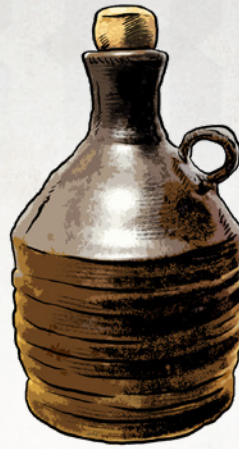
Jug of Astral Mead, 2 pint container (2000 gp as pictured).

This clay is mined from the Elemental Plane of Earth, bringing the resilience of the element of earth to your creations.