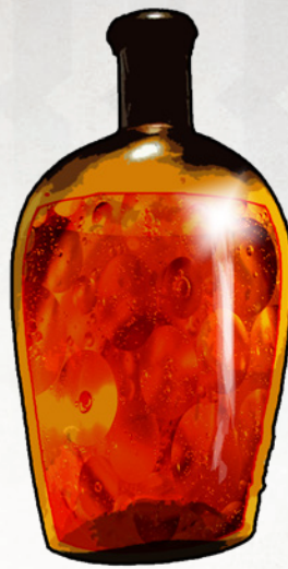
Fire Beetle Potion

When you cast a spell that causes fire damage you may use the flame rose to infuse power into the spell causing the targets of the spell to catch fire and take an additional 5 fire damage at the start of their next turn. The flame rose is consumed during the casting of the spell, erupting into a small burst of fire.