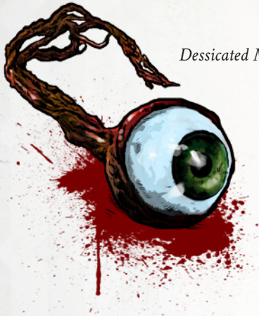
Desiccated Mummy's Eye

When you cast a spell that imparts the frightened condition you may use the desiccated mummy's eye to freeze the targets with fear. If the targets gain the frightened condition from the spell then they cannot move until they are no longer frightened. If the desiccated mummy's eye was created from a mummy lord then the saving throw DC of the spell also increases by 2 in addition to the above effect. Once used the eye will disintegrate into a chalky powder.