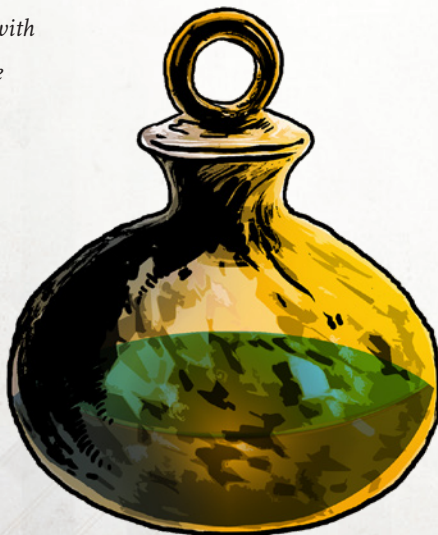
Elixir of Accuracy with decorative bottle

Once you drink this elixir you may double your proficiency bonus to a single attack roll made before the end of your next turn.