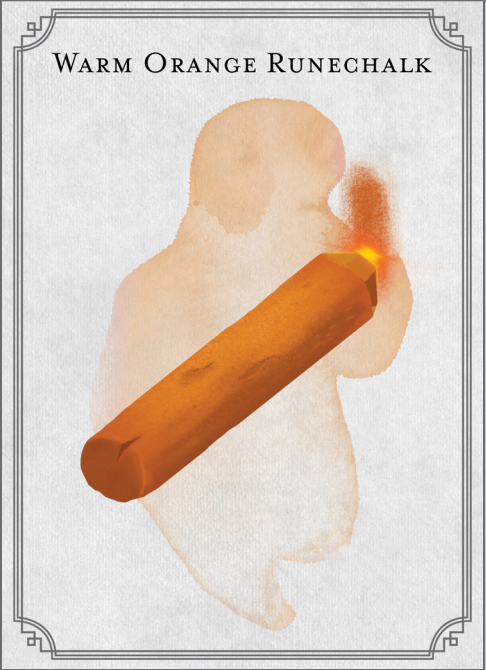
WARM ORANGE RUNECHALK

FLAME RED RUNECHALK Common Wondrous Item Chalk One Up: As an action you can use this chalk to draw a simple symbol. A creature using this chalk must have at least an intelligence of 6 to draw these symbols. Only one of the symbols can be active at a time. You can draw up to 20 symbols with this chalk before it is completely used up. Square Lasts for 24 hours maximum. The first creature that walks over this symbol has to make a Dexterity saving throw (DC10) on success they take no damage, on a fail they get hit by an erupting flame and take 1d6 Fire damage. After this happens the symbol disappears. Circle Conjures a non-magical campfire that can burn for a duration of 8 hours. Triangle Cooks all the food in a 2ft cube with a quality as if prepared by a professional chef. Cross Casts the spell Heat Metal on the (metal) item it is drawn on. Bonus Action