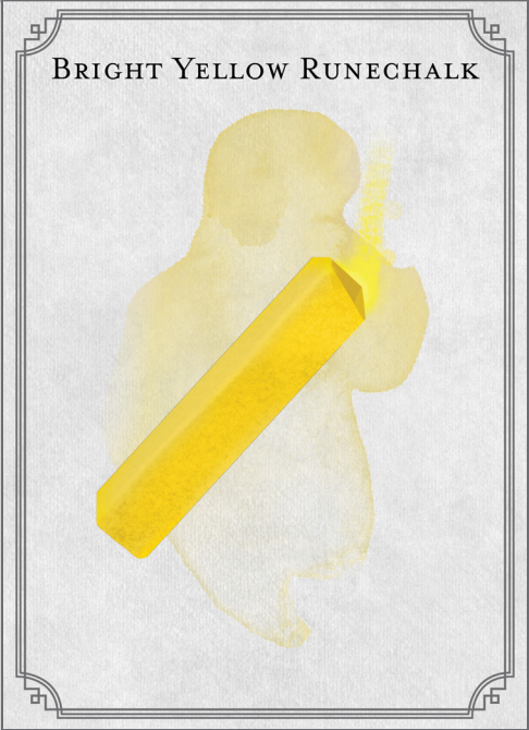
BRIGHT YELLOW RUNECHALK

WARM ORANGE RUNECHALK Common Wondrous Item Chalk One Up: As an action you can use this chalk to draw a simple symbol. A creature using this chalk must have at least an intelligence of 10 to draw these symbols. You can draw up to 20 symbols with this chalk before it is completely used up. Using this chalk you can transmutate a 1ft cube of stone, wood or metal, this effect lasts for 1 hour after which the material turns back. This chalk does not work on any equipment or weapon that is being worn or carried. Square Turns 1ft cube of material to wood Circle Turns 1ft cube of material to solid rock. Triangle Turns 1ft cube of material to solid iron Cross Turns 1ft cube of material to loose earth. Bonus Action